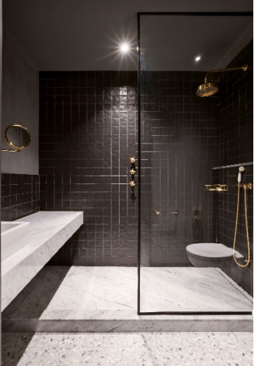
Bedroom and bathroom - Room Mate Gerard Hotel