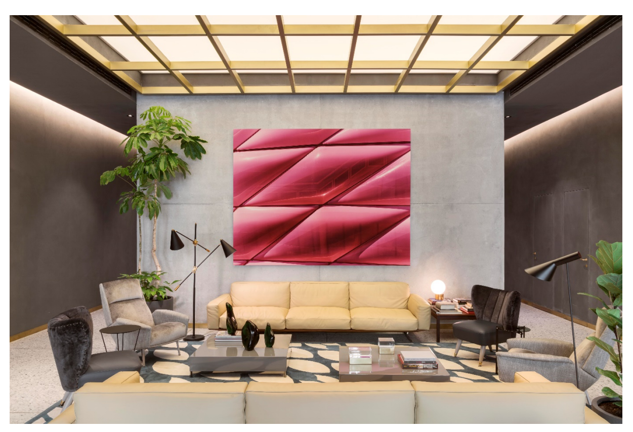
Lobby - Room Mate Gerard Hotel

Located in the middle of Barcelona's Ensanche district, the Hotel Room Mate Gerard has 66 rooms, divided into 3 categories: basic, standard and deluxe. It is located two steps from the effervescent Paseo de Sant Joan and is adjacent to the emblematic modernist building Casa Burés. "It's an emerging area that breathes creativity, avant-garde and design, values that are perfectly identified with the Room Mate Gerard hotel", says Beriestain. Including this hotel, there are now 5 establishments that the hotel chain has in the city of Barcelona.