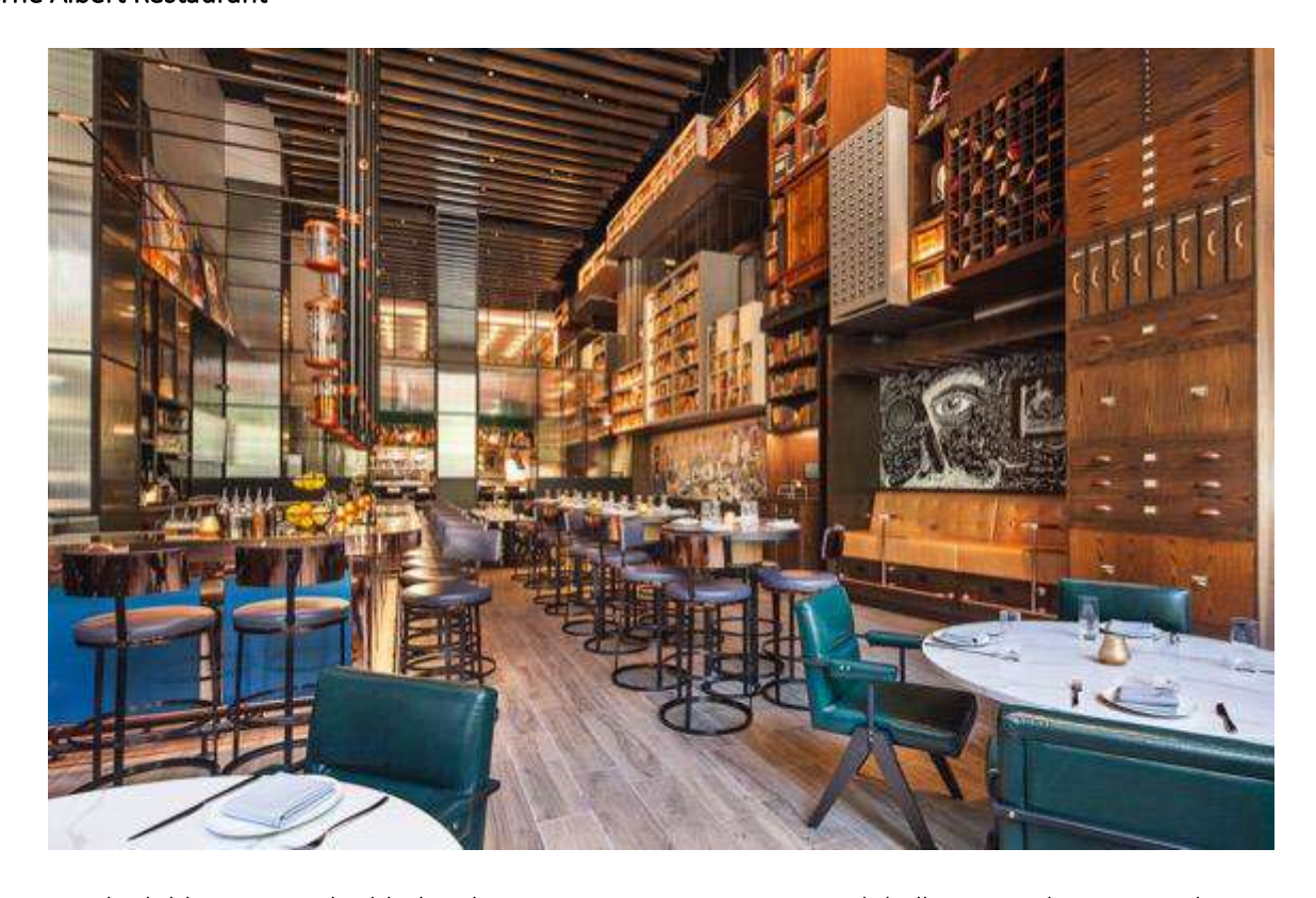
Next to the lobby, an airy double-height 120-seat restaurant serves globally-inspired cuisine and handcrafted cocktails.