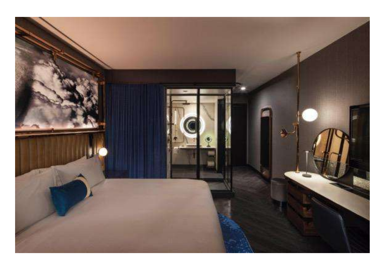
A copper pole next to the desk supports a brass phonograph-style speaker, adjustable lamps, and rotating wooden desk drawers.