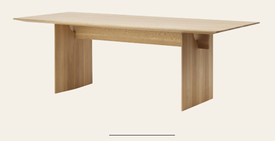
N - DT01 DESIGN: NORM ARCHITECTS

For case study 08, the Hiroo Residence Project, the N-ST01 side table has been modified with an extended marble table top.