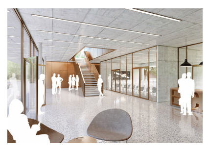
Research Building - ECAP Laboratory Erlangen