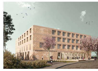
Music Academy in Staufen