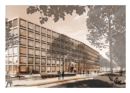
Laboratory Building of the Beuth Technical University in Berlin