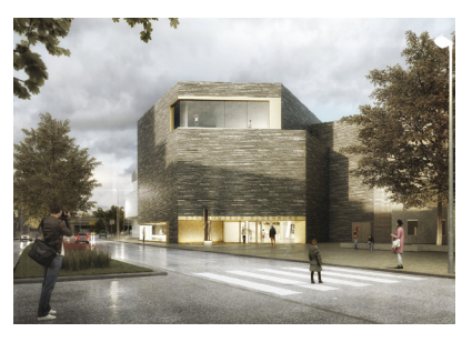
City Museum of Oldenburg