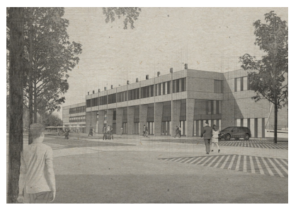
Trave-Campus of the Chamber of Crafts in