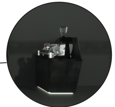
Play Zone bar with under lighting