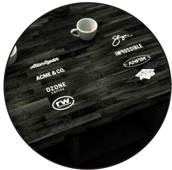
Vinyl cut Logos stuck to bar top.