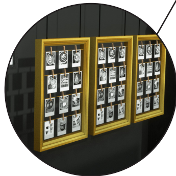
Gold sprayed frames, for displaying polaroids.