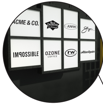
Light boxes with vinyl cut Logos.