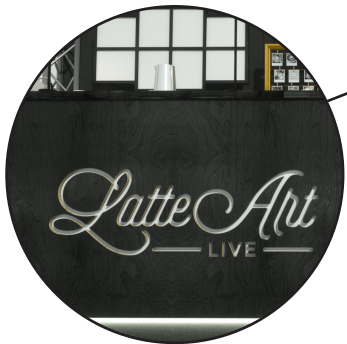
L shaped bar with back lit logo and LED under lighting.