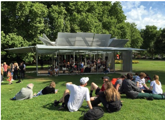
MPAVILION 2014, SEAN GODSELL OF SEAN GODSELL ARCHITECTS, now modified, can be visited on the grounds of the Hellenic Museum in central Melbourne.

enables design awareness to continue into new communities for years to come. You can now visit the internationally celebrated MPavilions in and around the city.