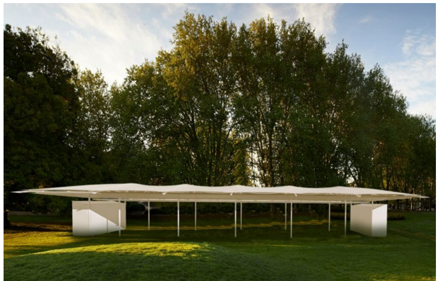
MPAVILION 2019, DESIGNED BY GLENN MURCUTT AO University Square, University of Melbourne