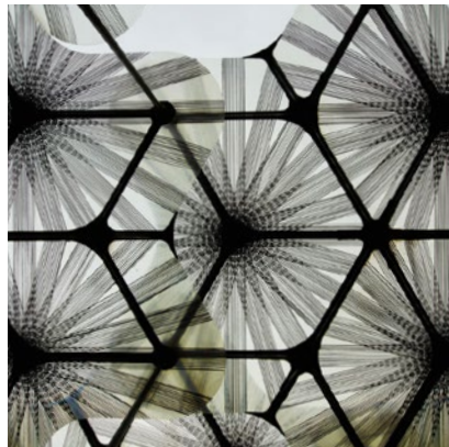
MPAVILION 2015, AMANDA LEVETE OF AL_A resides at Docklands Park, at the corner of Collins Street and Harbour Esplanade, Docklands.