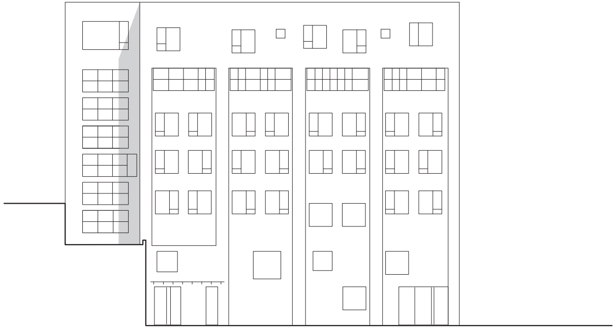
New north east elevation