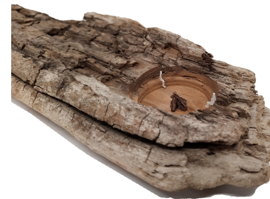
Pavilion of the Sky