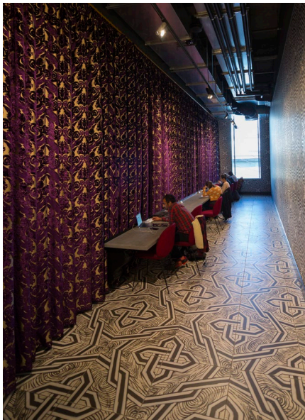
Pick the patterns from the 16th to 21st centuries.