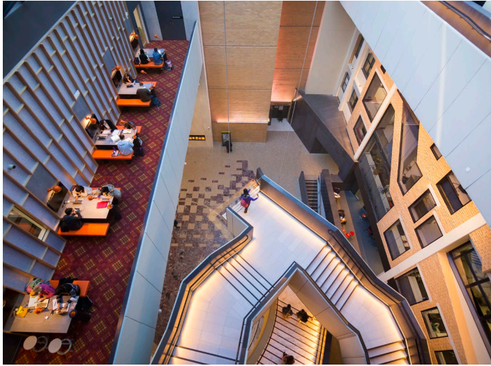
There's 1970s tartan.

The Faculty of Arts didn't want classroomy-looking classrooms, or bare corridors. So we created rich interiors that explore a multitude of themes, stories, people, places and times.