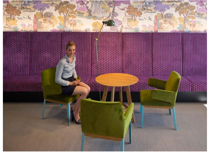
There's a research lounge with French landscaped garden wallpaper and magenta banquette seating.