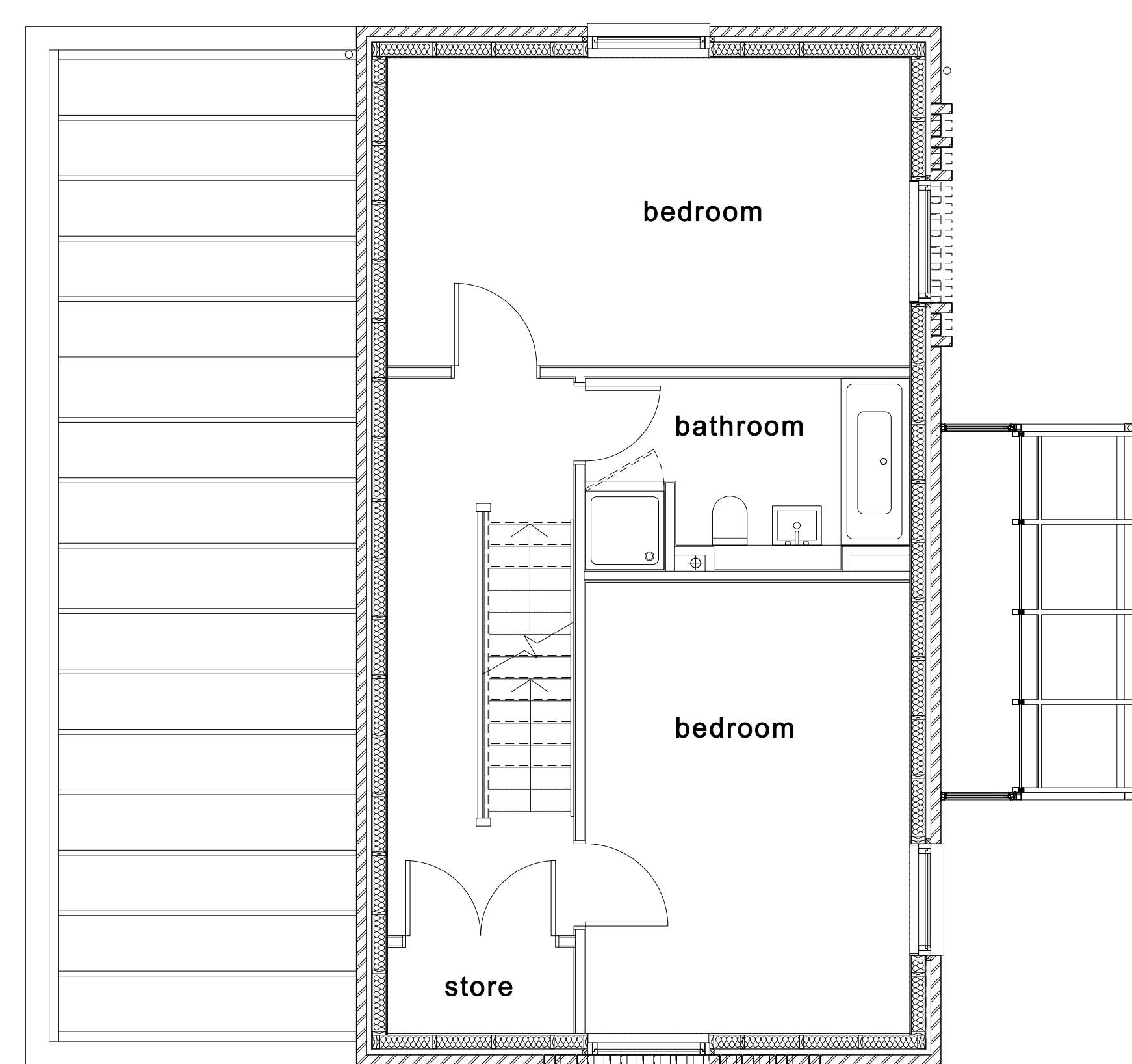
PLOT 1 - First Floor Plan