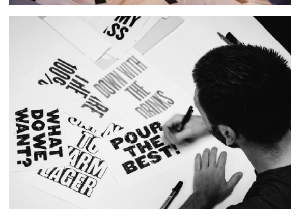
Graphic design: Marnich Associates, Lagranja Design