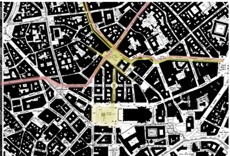
Schema d' inquadramento urbano