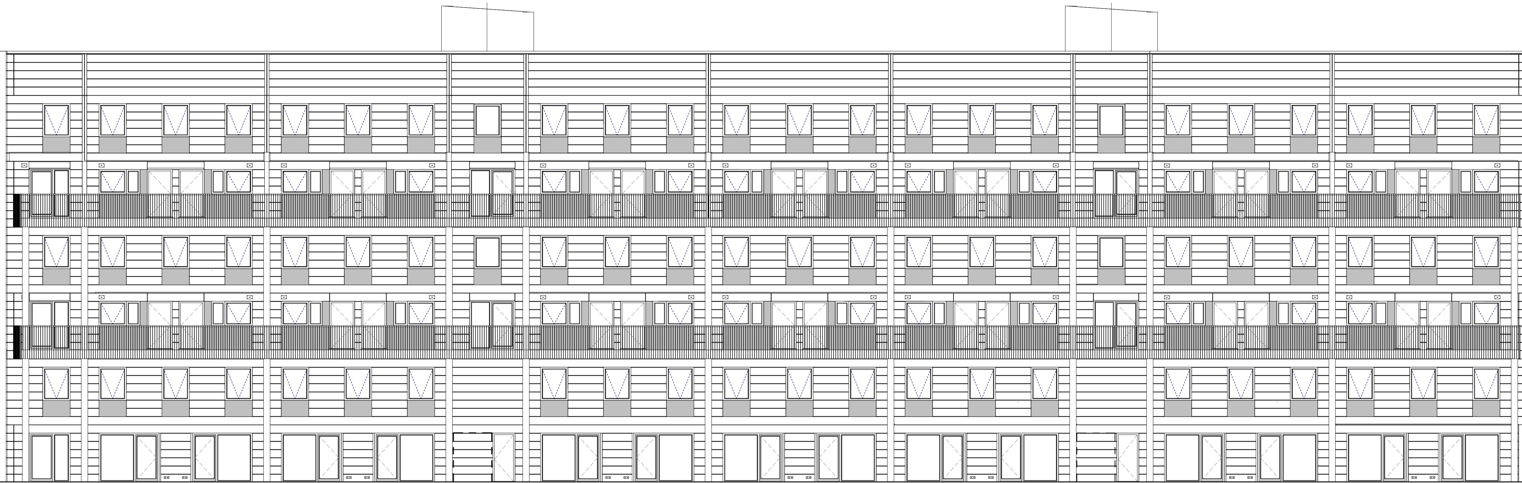
01 EAST ELEVATION