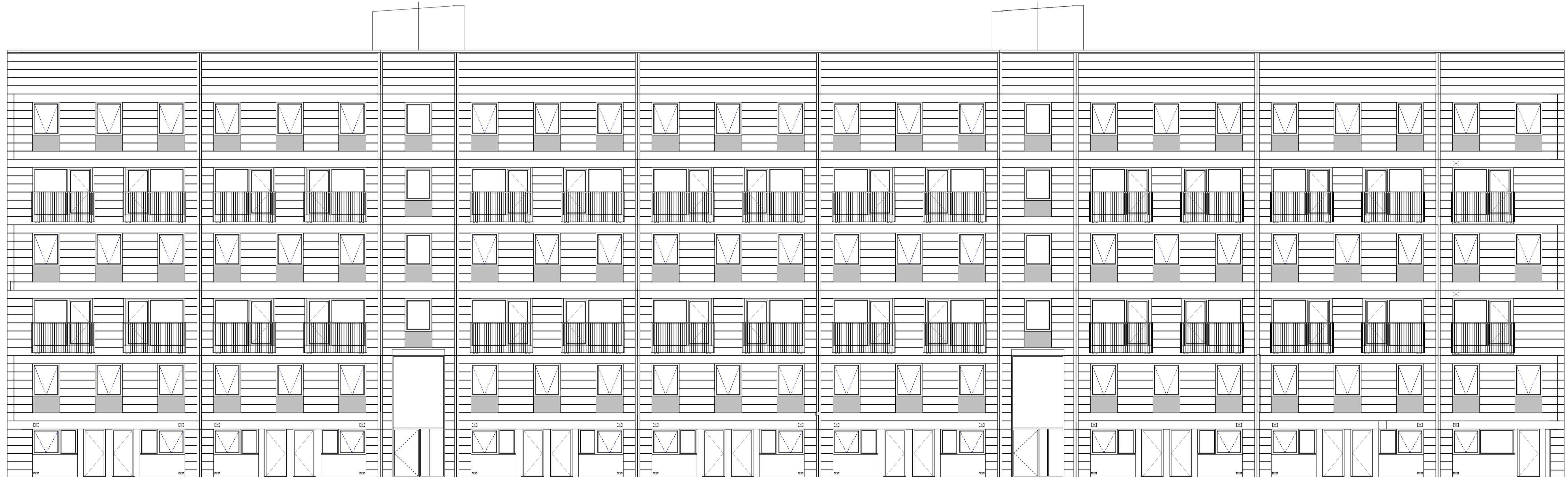
02 WEST ELEVATION