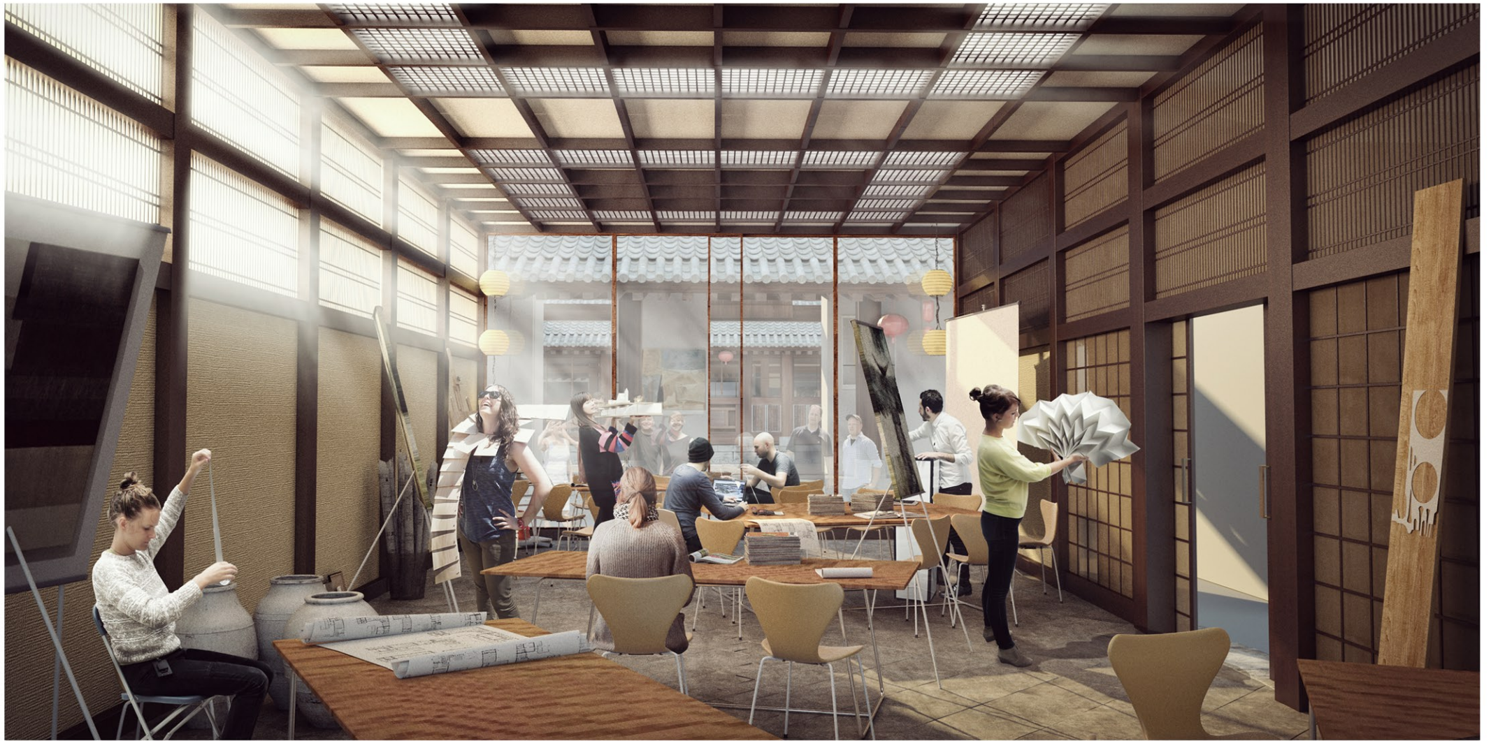
Proposal view on interior of workshop area