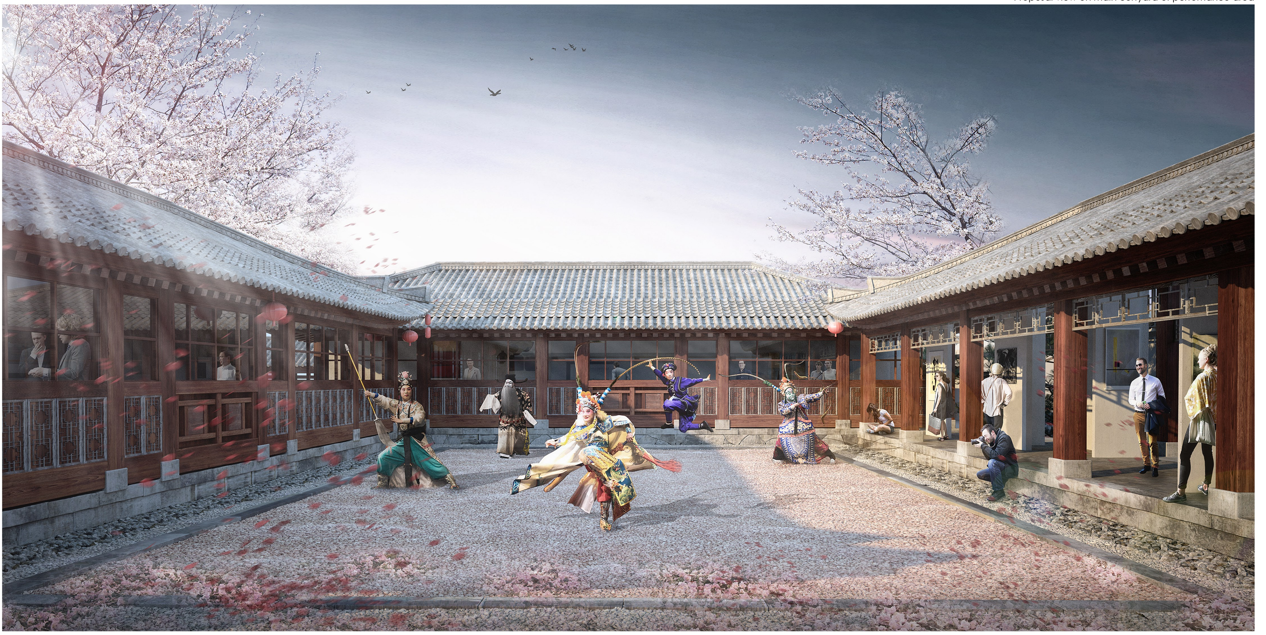
Proposal view on main courtyard of performance area

Proposed "art-incubator" becomes a mental intangible door to our past and a place of collective memory. All of these features will help in the development of the China self-identity.