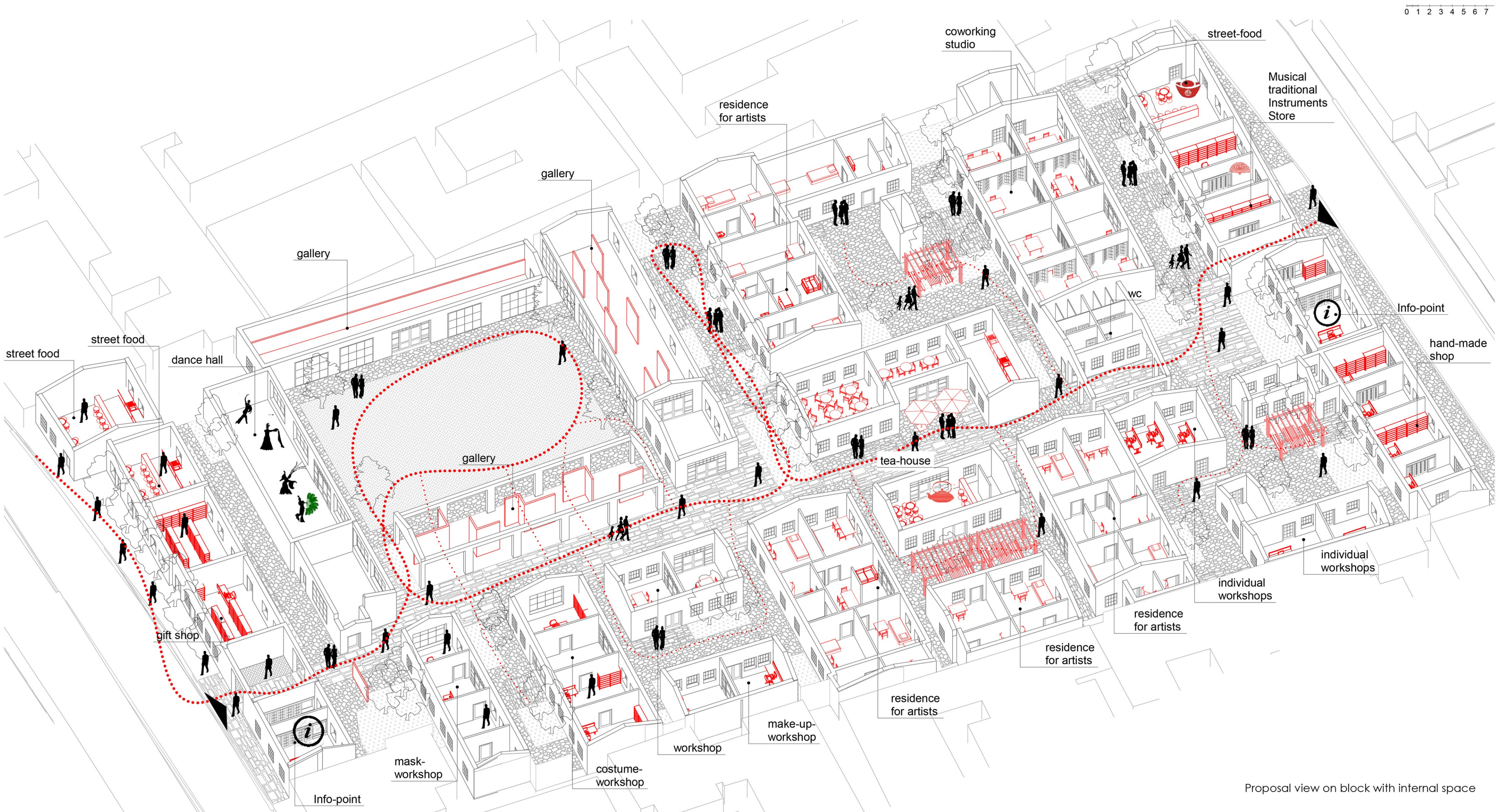
Proposal view on block with internal space