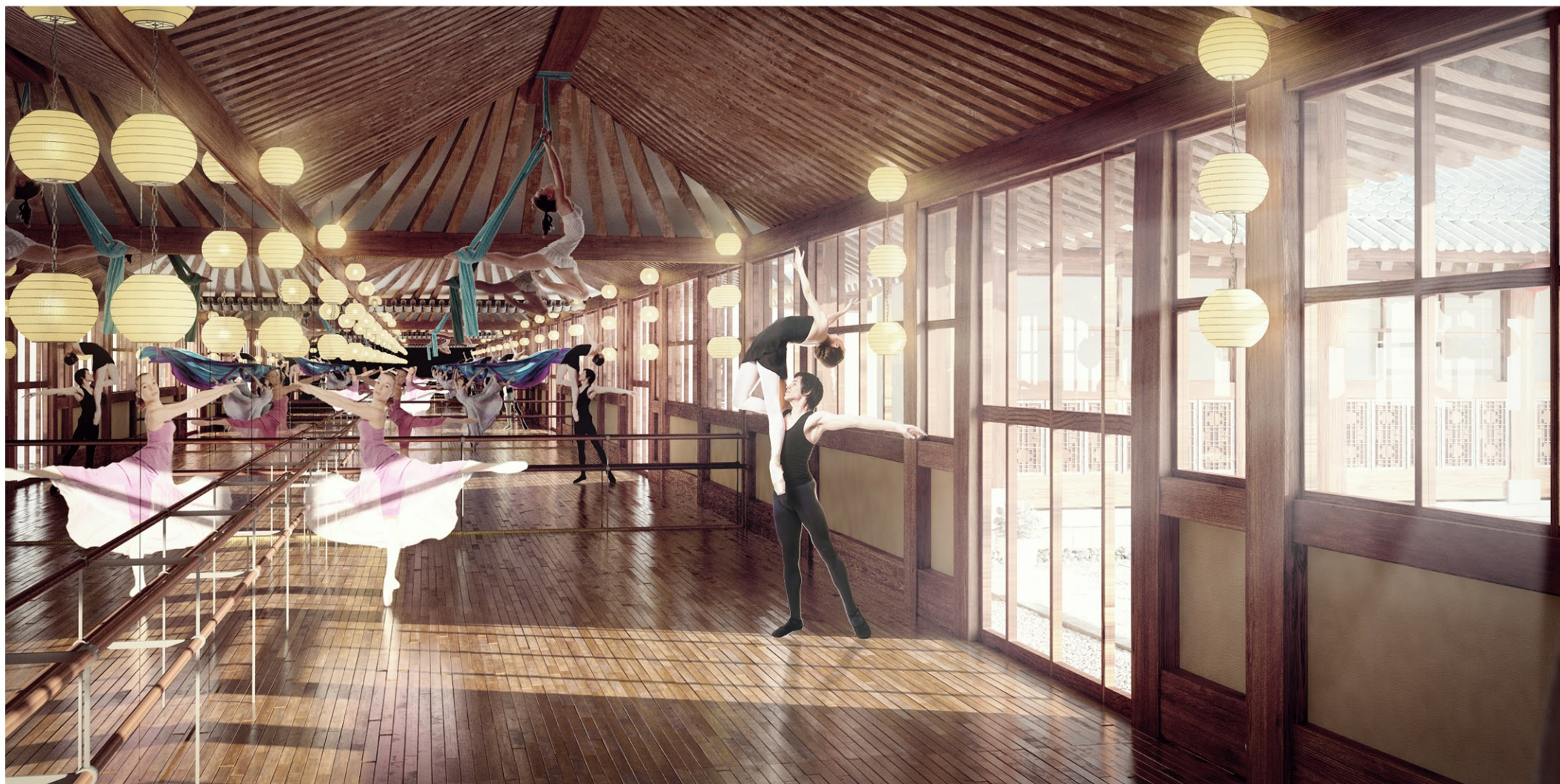
Proposal view on interior of dance hall