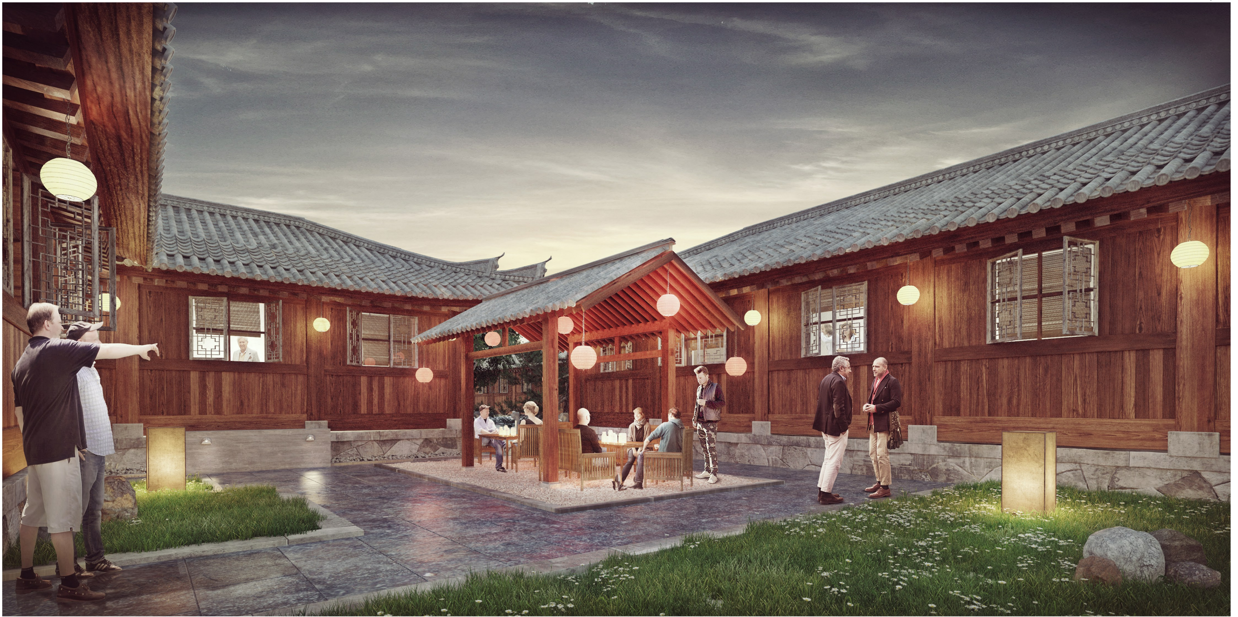
Proposal view on courtyard of residence area