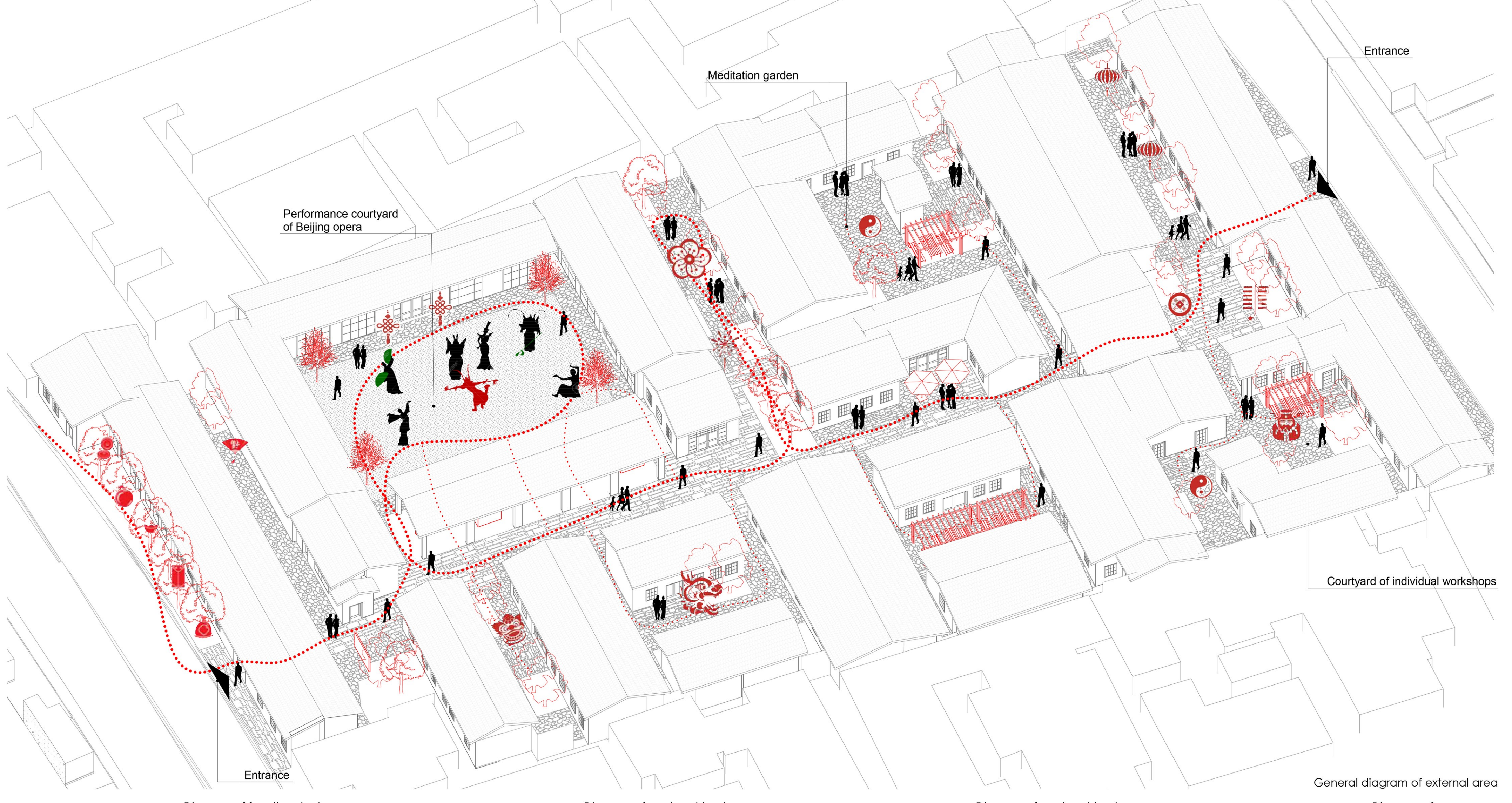
Diagram of functional scheme