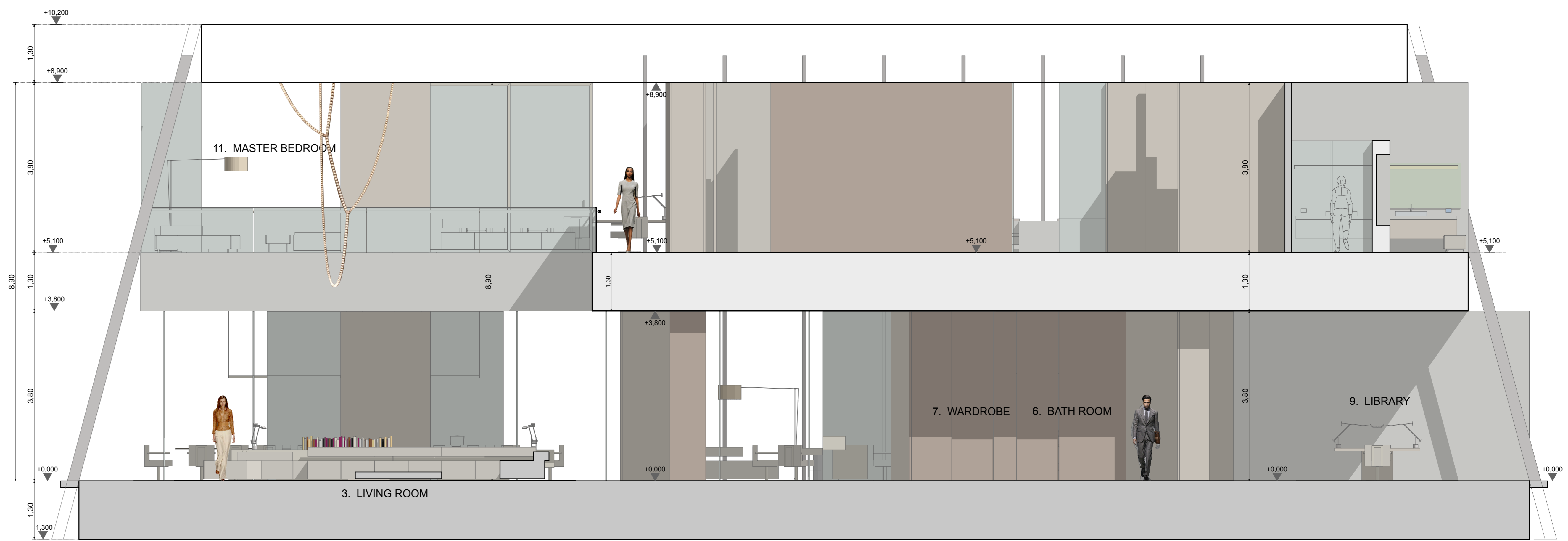
SECTION ELEVATION A03

WODA WORKSHOP of ARCHITECTURE & DESIGN CLAUDIO ZUCCONI ARCHITECT Via A. Manzoni 011, 51019 Pienza (SI) Toscana - Italy Tel. +39 0572 - 959981 Cod. Fisc. ZUC. CLD 61830 GAPPN - Part. IVA 011 954 047 2 E-MAIL: zucconidesign@yahoo.it / Piana Fieschi: claudio.zucconi@gpec.it / www.archilovers.com - claudio.zucconi