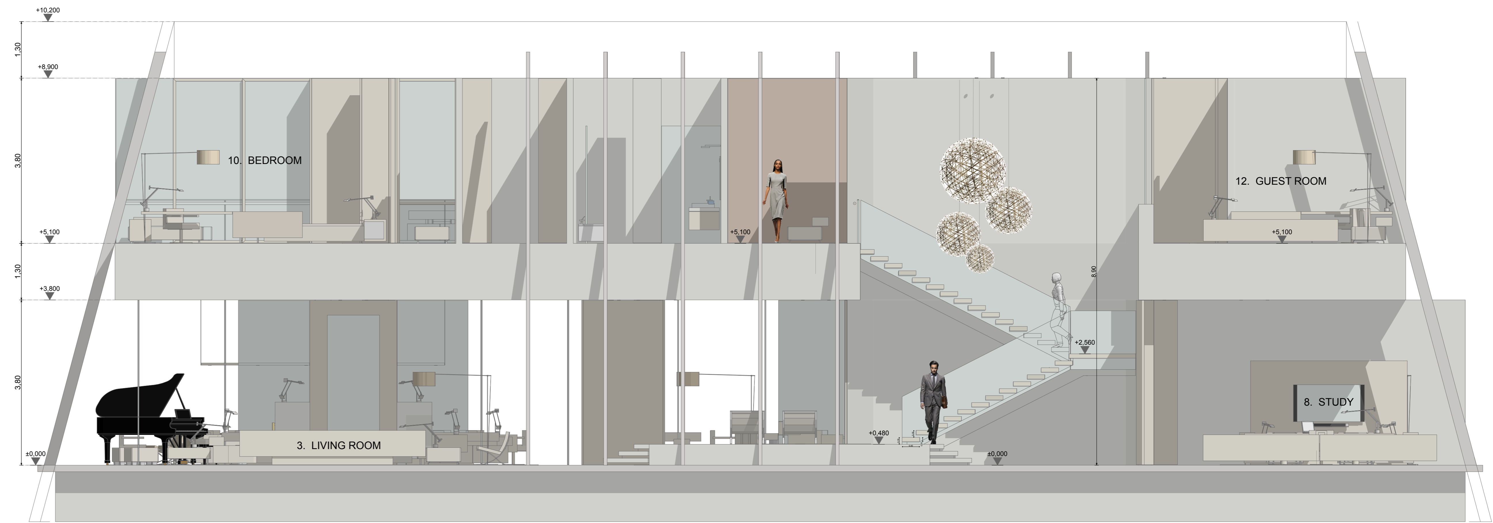
SECTION ELEVATION A04