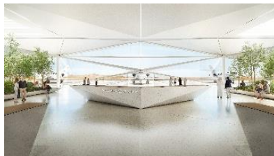
The embarkment gate