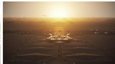
The international airport at AMAALA

RIYADH – 24 June 2020 – AMAALA, the ultra-luxury destination located along Saudi Arabia's northwestern coast, has unveiled plans for a new international airport, with a design inspired by the optical illusion of a desert mirage.