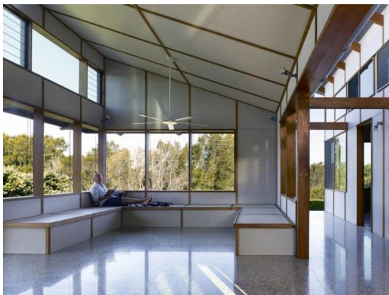
New House under 200 m 2 'Dogtrot House' by Dunn and Hillam Architects NSW

The award category winners are as follows: