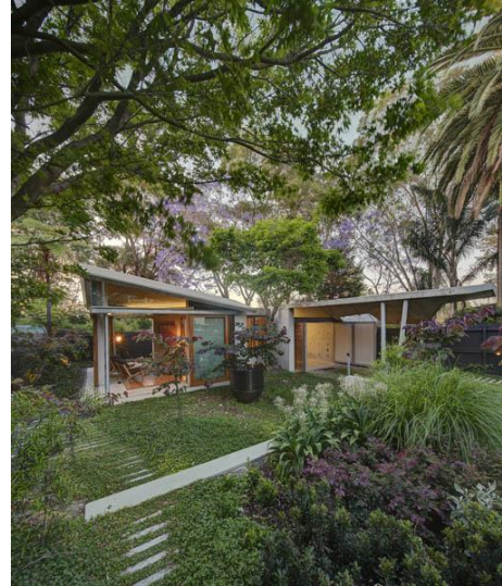
Outdoor 'The Garden Project' by Welsh + Major Architects NSW