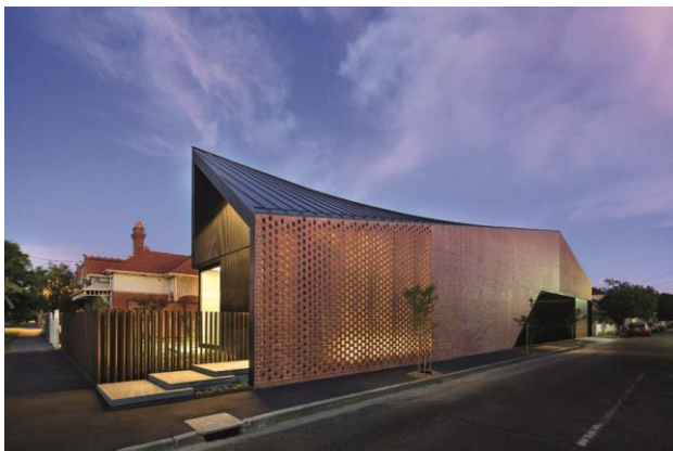
House in a Heritage Context (joint winner) 'Middle Park House' by Jackson Clements Burrows VIC