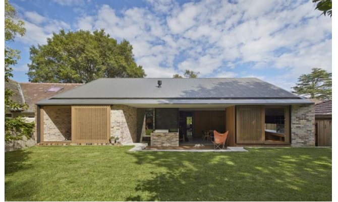
House Alteration & Addition over 200 m 2 'Skylight House' by Andrew Burges Architects NSW