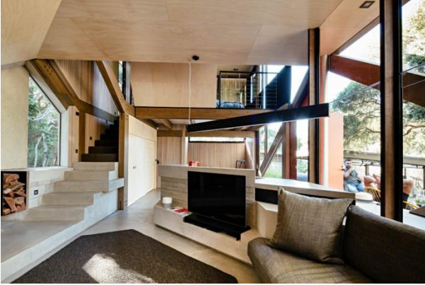
House Alteration & Addition under 200 m 2 'Cabin 2' by Maddison Architects VIC