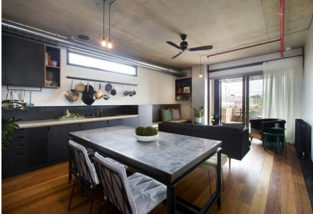
Sustainability 'The Commons' by Breathe Architecture VIC