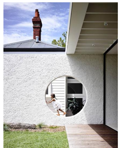
House in a Heritage Context (joint winner) 'Westgarth House' by Kennedy Nolan VIC