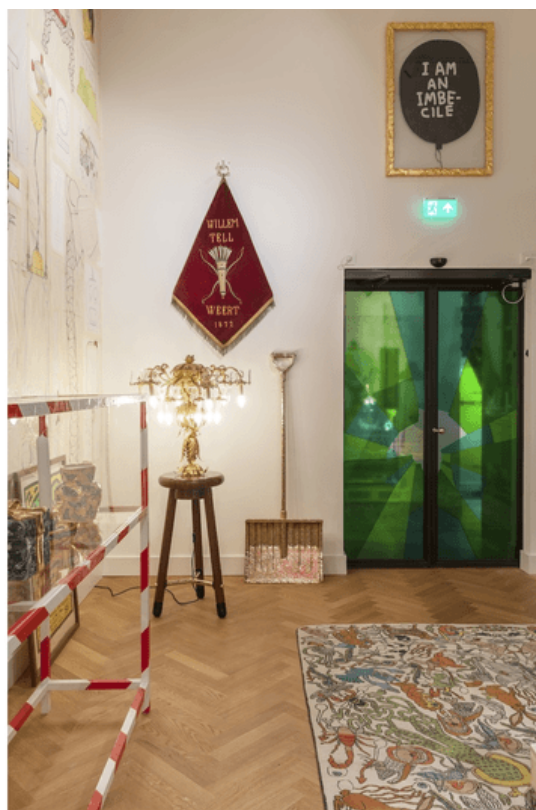
Museum W / Solo exhibition FOREVER ENDEAVOUR by Job Smeets & Studio Job (on entire ground floor)

The façade, which is fitted with golden shutters on all stories, refers not only to the historic façade on the Markt side with its characteristic red shutters flanking the cross-windows, but can also be construed as an enormous Advent calendar: behind every shutter a 'treasure' – a relic or work of art – is concealed. The shutters are fixed in place, but the façade – with seams 40 mm wide between the shutters – has been designed in such a way that it appears as if they can all be opened. Through this project Maurice Mentjens, as a designer and a storyteller, has embellished the history of the museum with a new chapter.