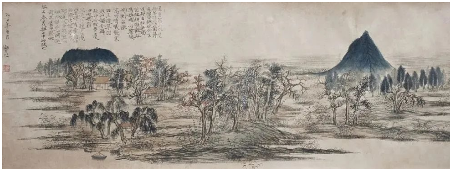
Autumn Colors on the Que and Hua Mountains, Zhao Mengfu

Across from Jinan's famous lake, geometric volumes form a multi-level waterfront village, an animated commercial and social meeting point with a front-row view. Commanding a panoramic view of Jinan's Huashan Lake, this innovative hub is crafted as a cultural encounter, and entertainment inspiration for residents and tourists alike.