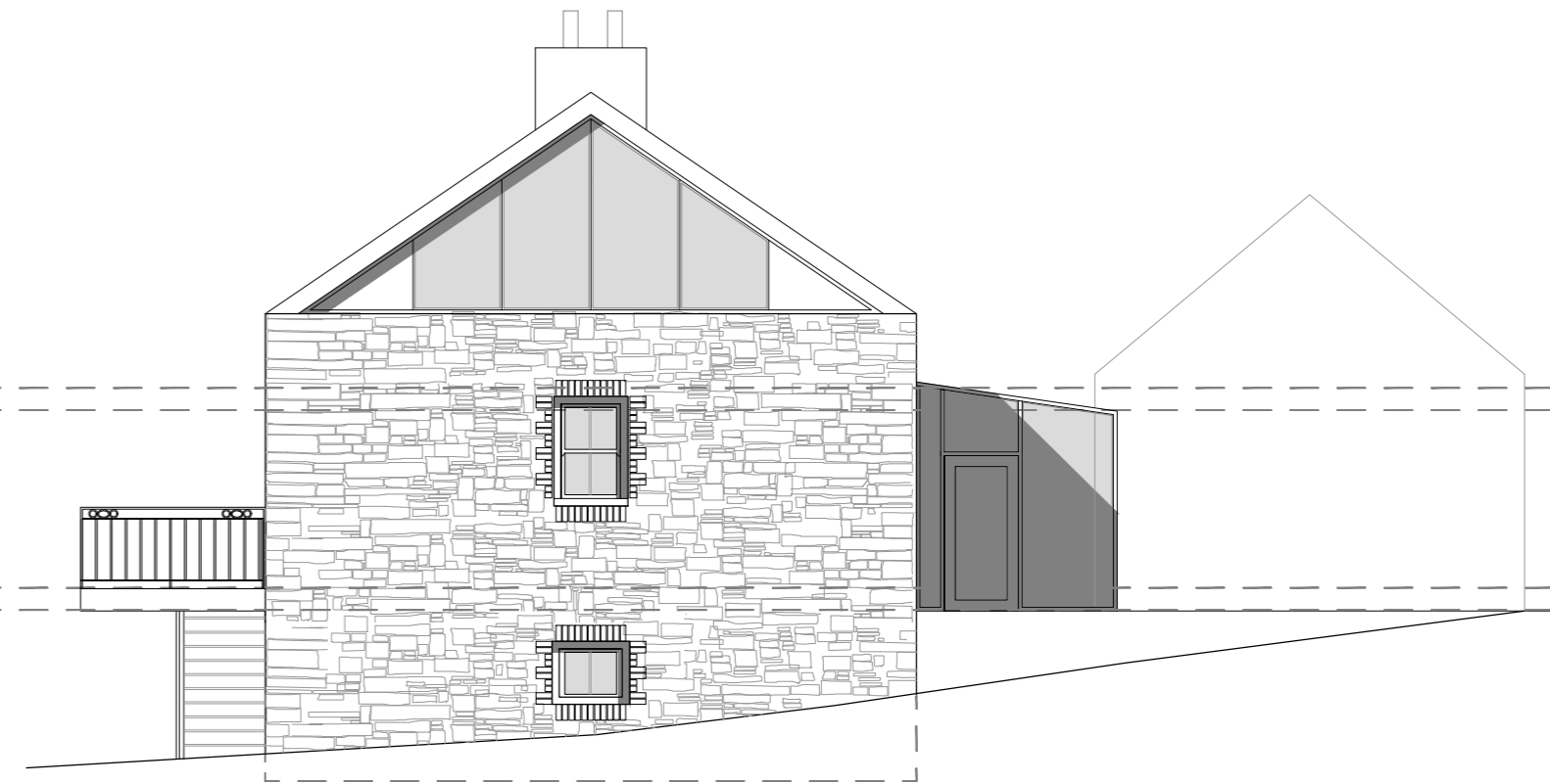
proposed side elevation: