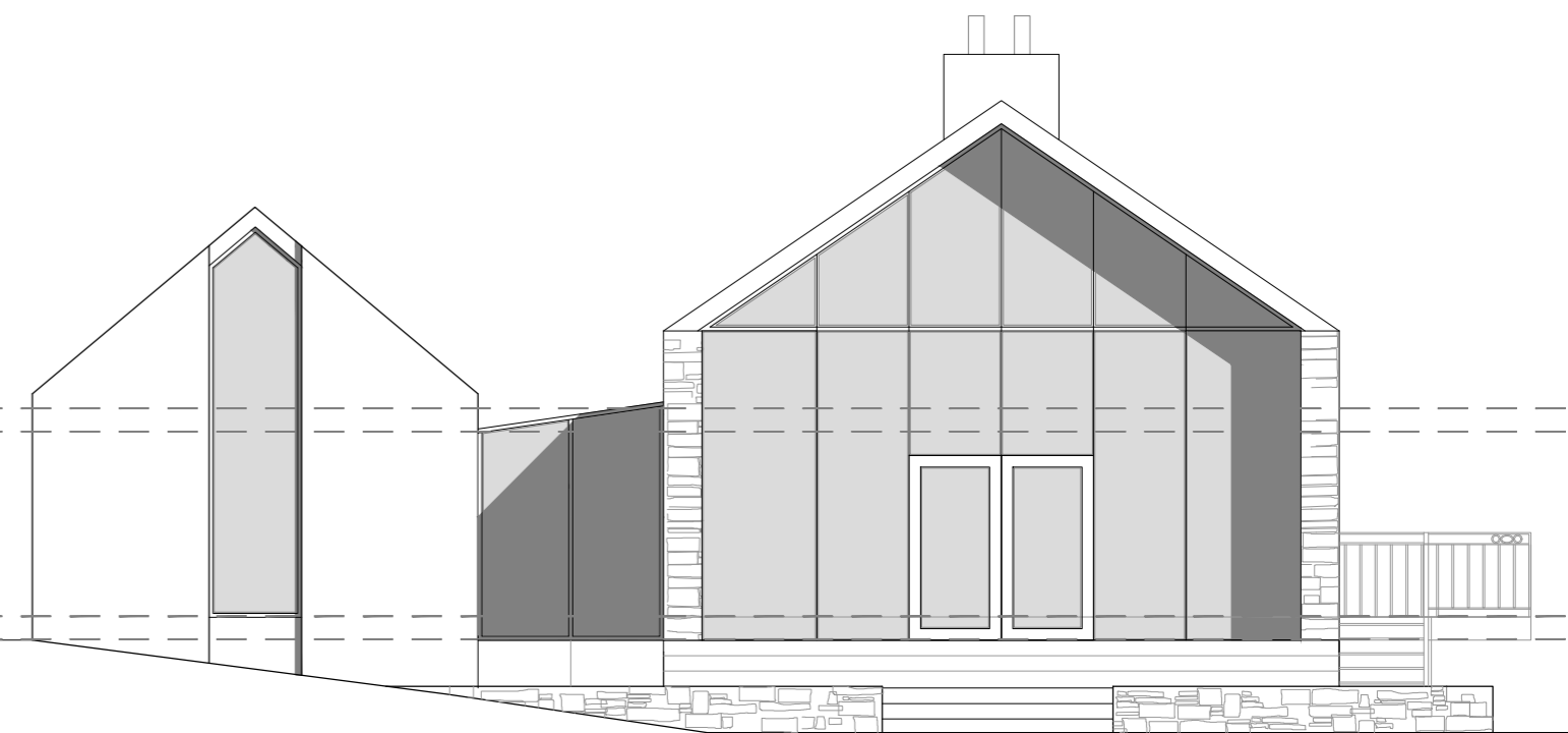
proposed side elevation: