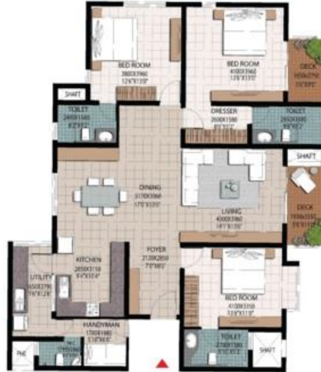
3-Bedroom + 3 Toilets + Servant room 2290 sq.ft.