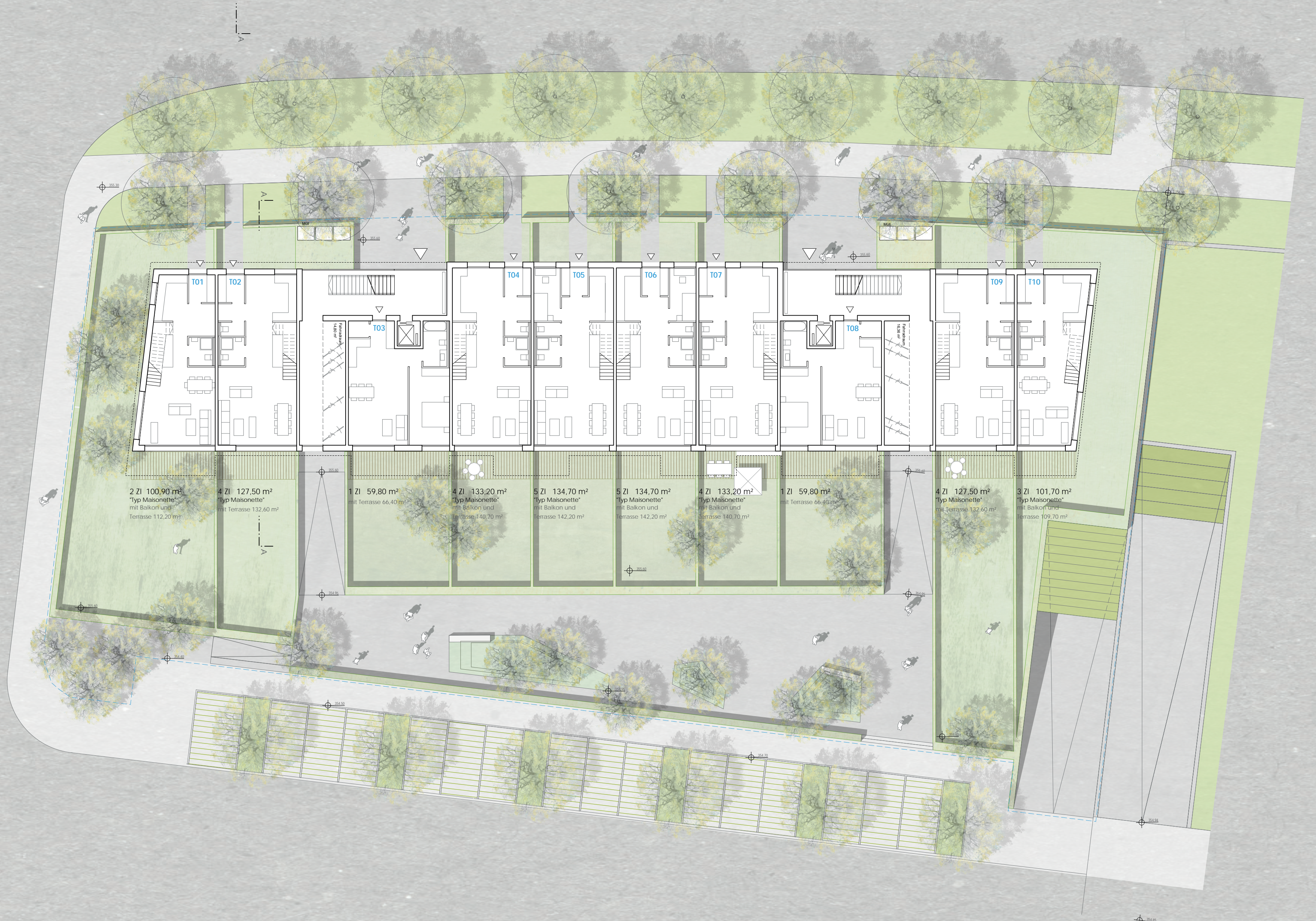
Grundriss Erdgeschoss M 1:200