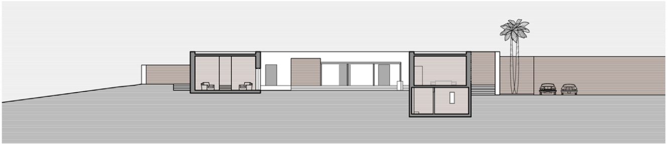
TOMH A-A SECTION A-A