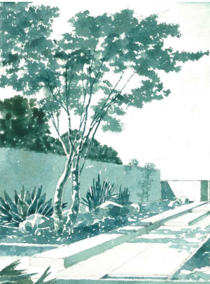
Vegetable gardens and internal patios

Internal paths, cuts and visual telescopes ("long views") contribute non only to the logical and productive reorganization of the spaces, but also to sensory well-being of those who work there. The relationship between the internal spaces and external pertinences to the settlement (vegetable gardens and introverted patios) is the search for functionally adequate and spatially rich living and working conditions, an empathic relationship between man and the space in which he lives and works.