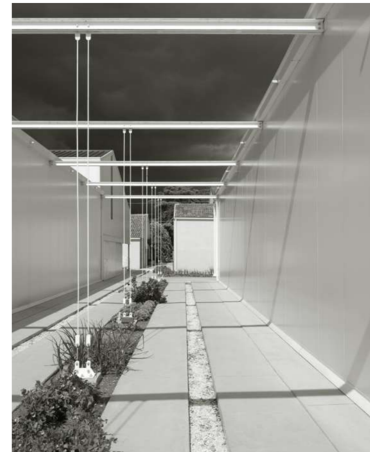
The aerial pergola whose construction elements measure the passage of time in the form of sundials