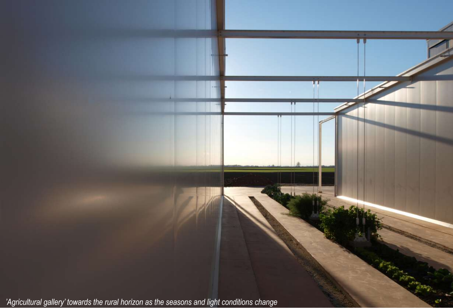
'Agricultural gallery' towards the rural horizon as the seasons and light conditions change