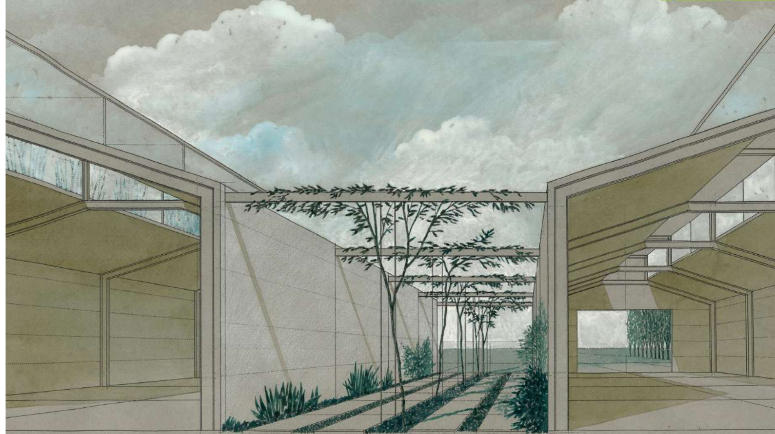
Perspective section on the agrarian gallery

Internal paths, cuts and visual telescopes ("long views") contribute non only to the logical and productive reorganization of the spaces, but also to sensory well-being of those who work there. The relationship between the internal spaces and external pertinences to the settlement (vegetable gardens and introverted patios) is the search for functionally adequate and spatially rich living and working conditions, an empathic relationship between man and the space in which he lives and works.