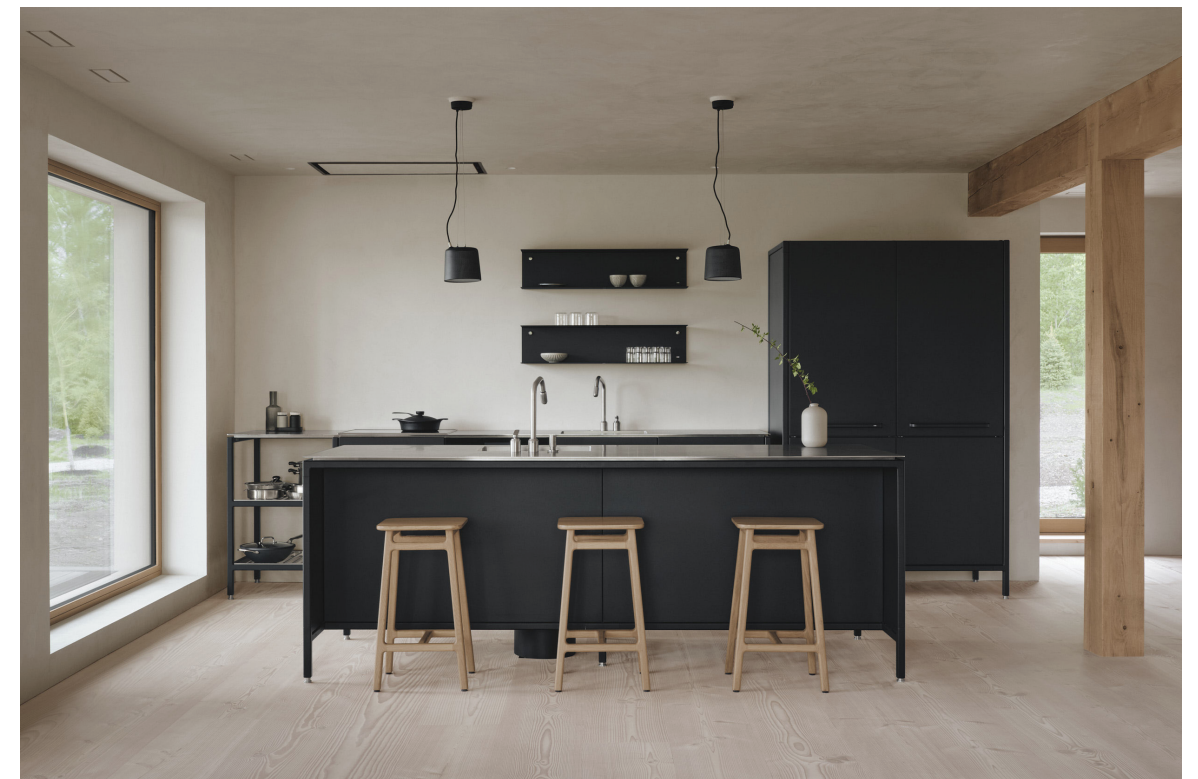
/residential kitchen : modular vipp kitchen, vipp lamps, atelier vaste stools