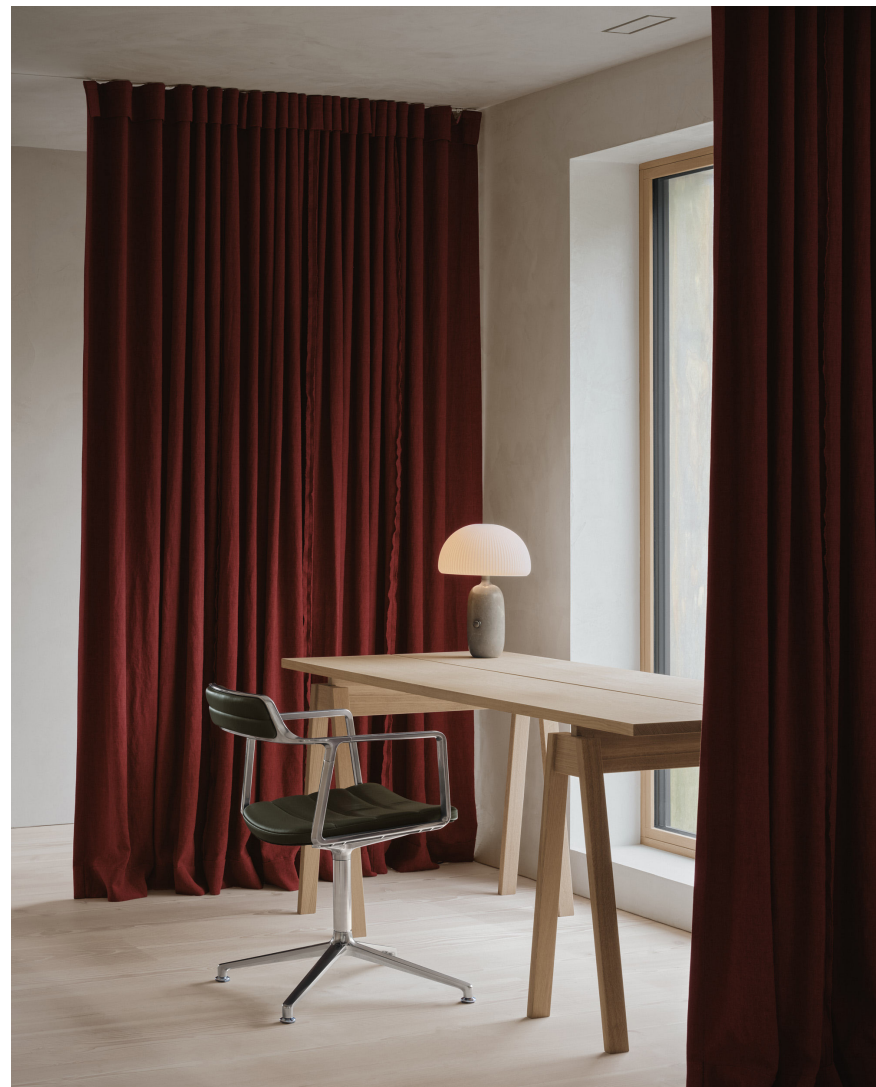
/ home office : vipp chair and lamp, dinesen table and floors, bisson bruneel linen curtains