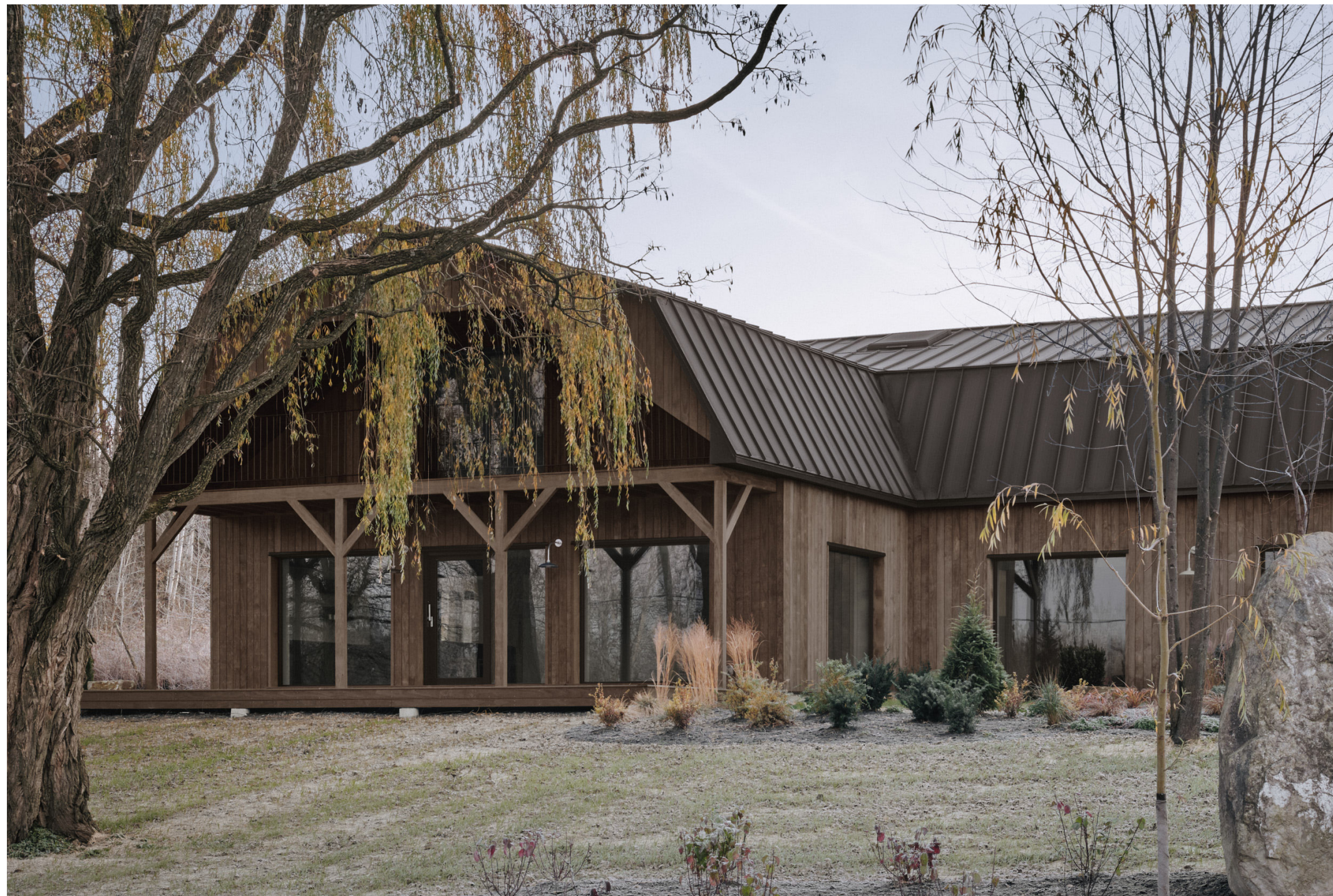
/ maison melba : dark brown steel roof, kebono wood siding, internorm windows