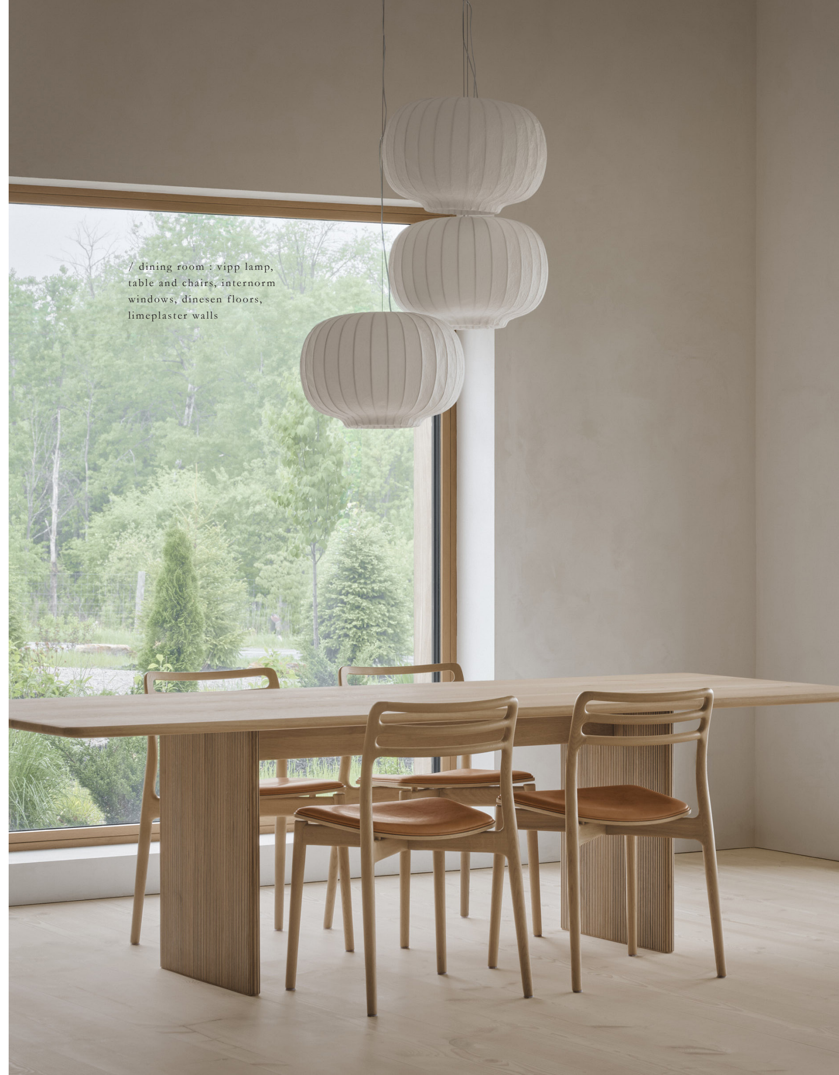
/ dining room : vipp lamp, table and chairs, internorm windows, dinesen floors, limeplaster walls