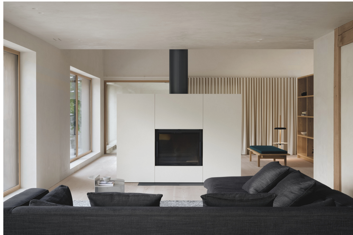
/ stûv fireplace