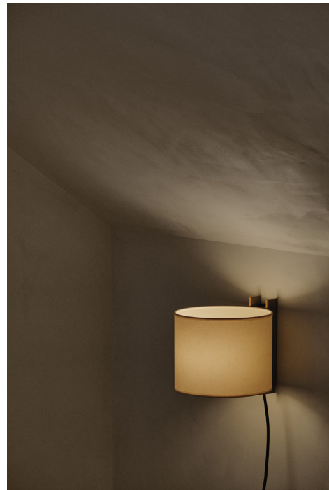
/ mezzanine : vipp lamp, dinesen custom bench, bisson bruneel curtain