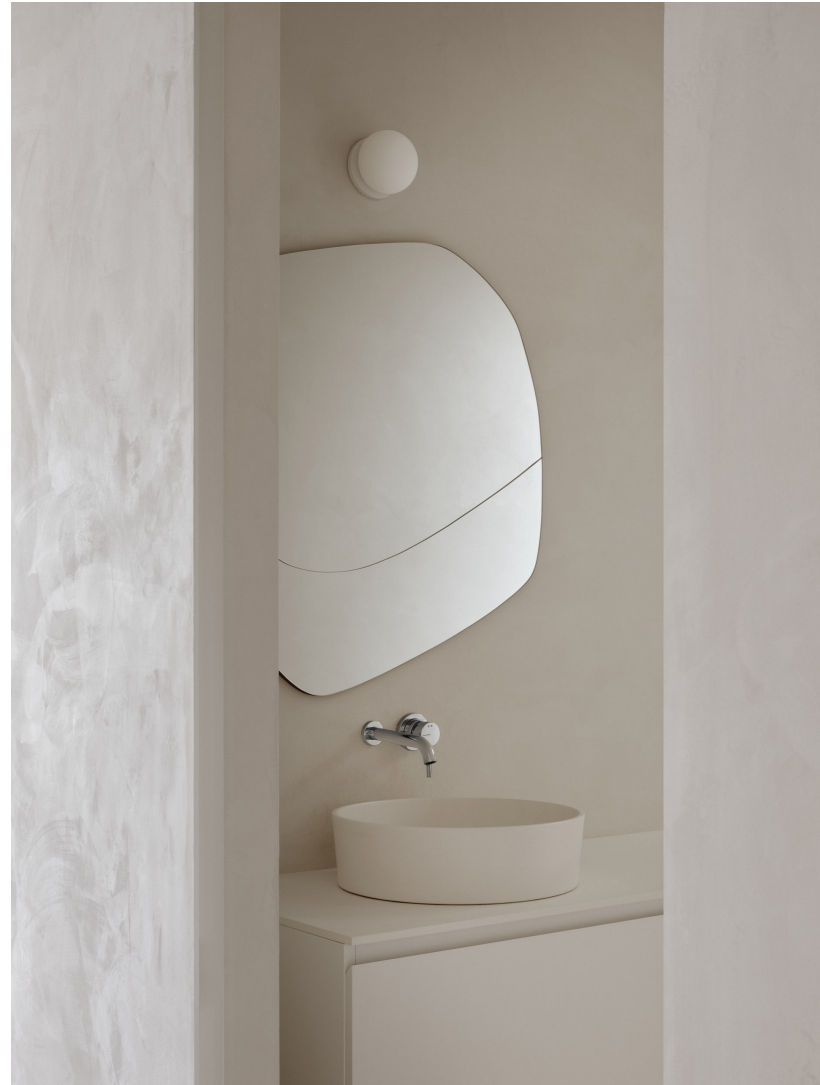
/ bathroom : mirror by clara jorsch, flos lamps, laufen sink, vanity by kastella, laufen bath, smoked glass window, velux skylight