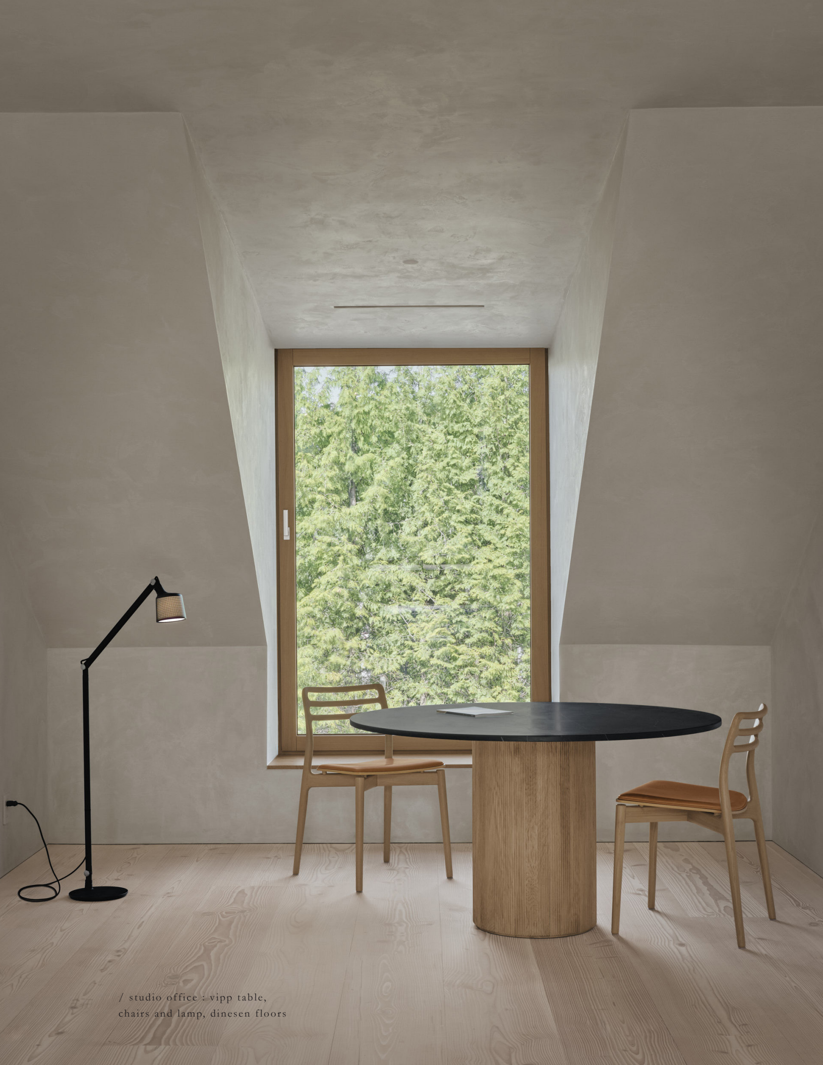
/ studio office : vipp table, chairs and lamp, dinesen floors