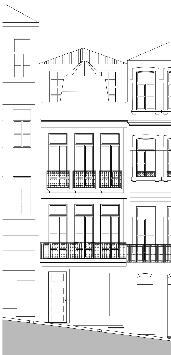
ALÇADO PRINCIPAL (A1)