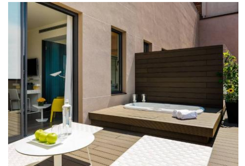
JUNIOR SUITE TERRACE WITH JACUZZI