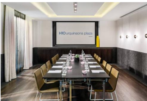
LA PALMERA ROOM – BOARDROOM LAYOUT

* Recommended (optimum) maximum capacity for these rooms by event type.