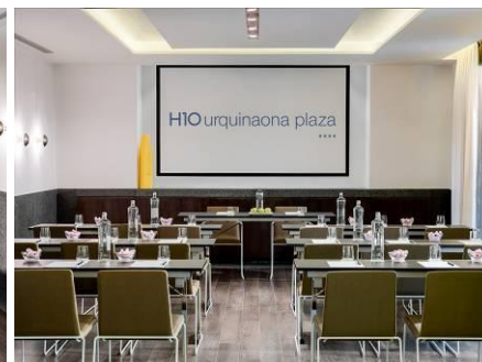
LA PALMERA ROOM – SCHOOL LAYOUT