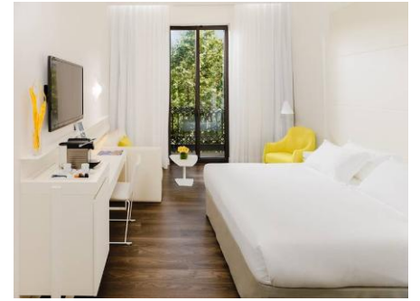
TRIPLE ROOM PLAÇA URQUINAONA