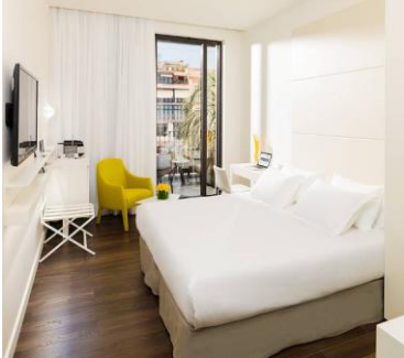
SUPERIOR ROOM WITH TERRACE