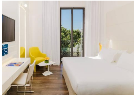
DOUBLE ROOM PLAÇA URQUINAONA