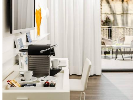
NESPRESSO COFFEE MACHINE SUPERIOR ROOM