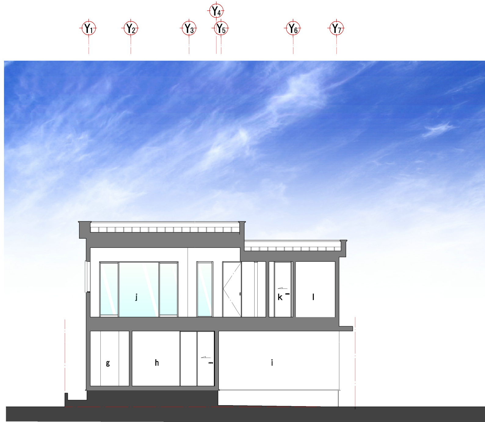
Section A - A`

g Walking closet h Master bedroom i Garage j Living dining k Dressingroom l Bathroom