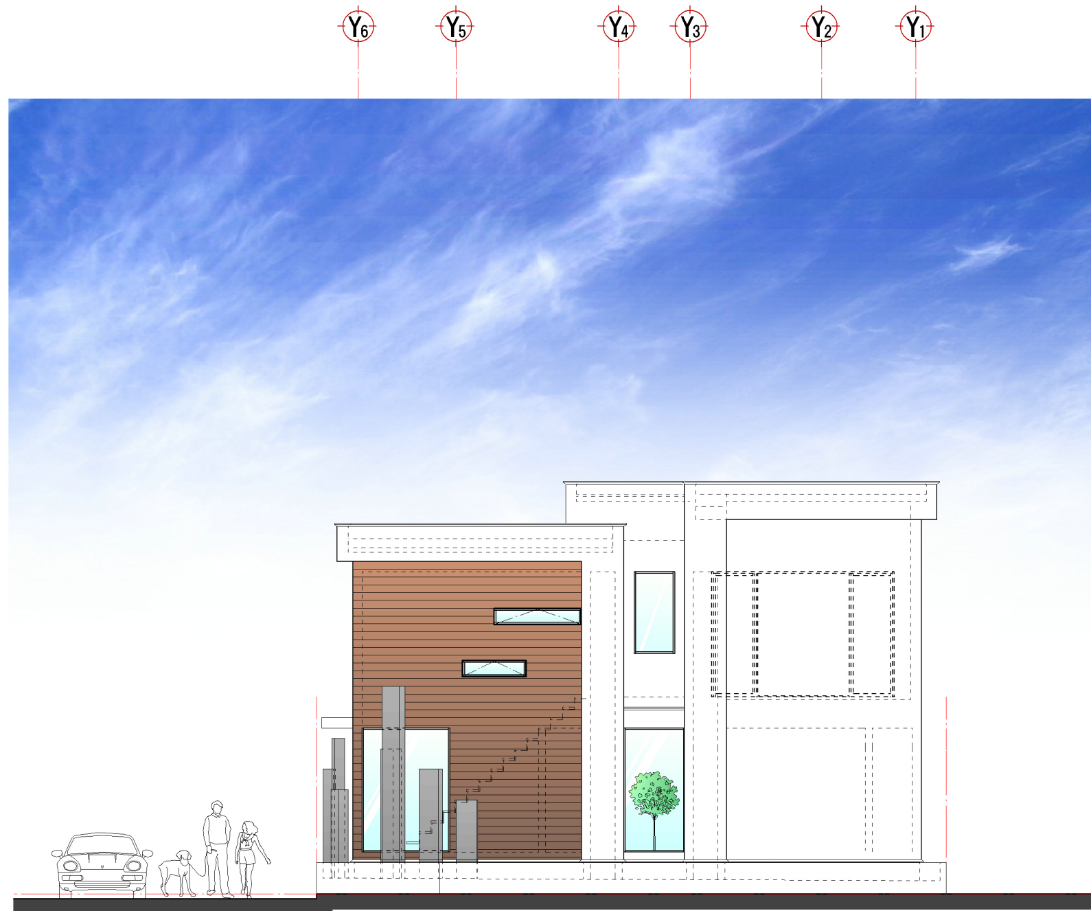
13 - house 「Modeling on the hill」