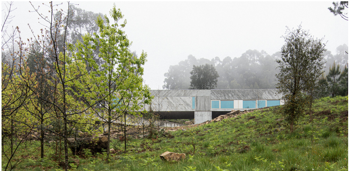
Casa no Tâmega by Hugo Ferreira + Nuno Melo Sousa

The project by the small-scale residential architecture award-winning architect has “a simple order: a house with four bedrooms, living room, kitchen, swimming pool and a barbecue. The terrain was complex [...]. A concrete volume sculpted with fine and thick patterns hides the river, imposing its opaque horizontality. Open from the inside to each different dimension of a rugged topography: the river, the hill, the quarry. A concrete base made from local stone is a staircase and structural base – the support that divides the private and public spaces of the house [...]. Materiality is a return to this same place; the pieces that make up the facade: the stereotomy veins are Stone veins created on site, together with sand, water and mortar on pine wood boards [...].”