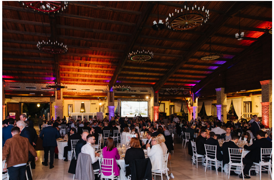
BigMat International Architecture Award'23 ceremony at Hacienda San Miguel de Montelirio, Seville

The BigMat Group, Building Material Distributors, was created more than 40 years ago, is the first international chain of independent traders for construction materials. The group is present in different countries in Europe: Belgium, Czech Republic, France, Italy, Portugal, Slovakia and Spain.