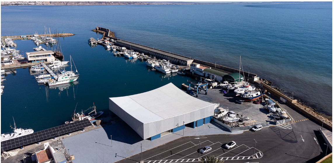
Lonja de pescado y ordenación zona sur del puerto de Roquetas de Mar by Estudio ACTA @ Fernando Alda Calvo

The project by the architecture award-winning architect aims “to mediate between both worlds, greenhouses and boats. One of the goals of the project is to improve the Port-City relationship and for this the first decision is to free the area of old buildings to create new synergies with the city, grouping different uses in a single volume [...]. The building aims to be very open and receptive to outside gazes but at the same time controlled in its circulations [...]. At the constructive level, the building presents a triple ascending reading: the ground floor is made of reinforced concrete [...]. On the post-tensioned slab that covers it, rests the graceful and light upper floor, with metal structure boxes and light slabs. The whole is topped by the curved metal structure that supports the textile envelope [...]. For the city, the new building aims to be a tribute to the world of the sea in the soft curves, tension and texture of its envelope: sails, nets, ropes,... provide silhouettes, colors and even materials for the building. [...].”