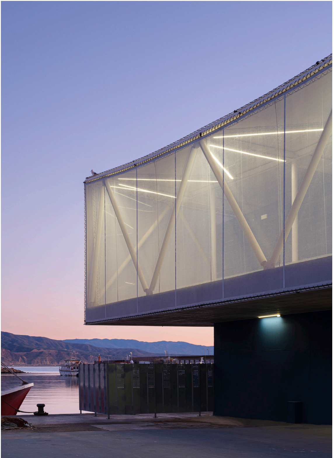
Lonja de pescado y ordenación zona sur del puerto de Roquetas de Mar by Estudio ACTA

The BigMat Group, Building Material Distributors, was created more than 40 years ago, is the first international chain of independent traders for construction materials. The group is present in different countries in Europe: Belgium, Czech Republic, France, Italy, Portugal, Slovakia and Spain.