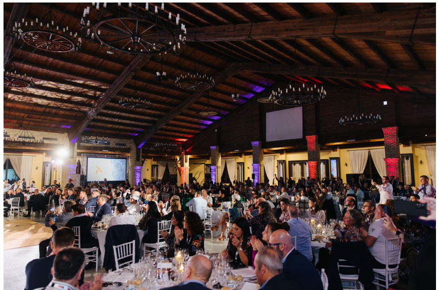
BigMat International Architecture Award'23 ceremony at Hacienda San Miguel de Montelirio, Seville

Read more about the BigMat International Architecture Award'23 and the Prize-Winners in our web www.architectureaward.bigmat.com