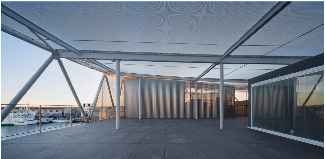
Lonja de pescado y ordenación zona sur del puerto de Roquetas de Mar by Estudio ACTA