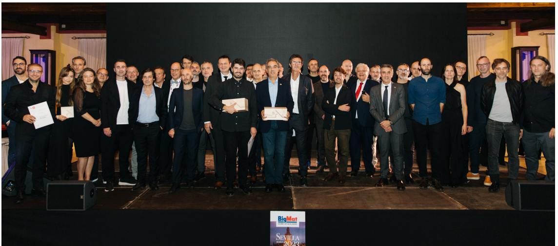
BigMat International Architecture Award'23 ceremony at Hacienda San Miguel de Montelirio, Seville

Casa no Tâmega, completed in 2020 by the Portuguese architects, and Lonja de pescado y ordenación zona sur del puerto de Roquetas de Mar (Almería), completed in 2022 by the Spanish studio, follow the Melopee School by Xaveer De Geyter, the Power Plant for the "FOZ TUA" DAM by Souto de Moura, the FRAC Nord-Pas de Calais art center by Lacaton&Vassal, the office building by Alberto Campo Baeza and the kitchen tower by Xaveer De Geyter as Grand Prize of the biannual award. The sixth edition of the BigMat International Architecture Award rewards European architecture with two Grand Prizes (30.000€), fourteen National Prizes (1.500€ each prize), and one Special Mention for Young Architects (1.500€ prize).