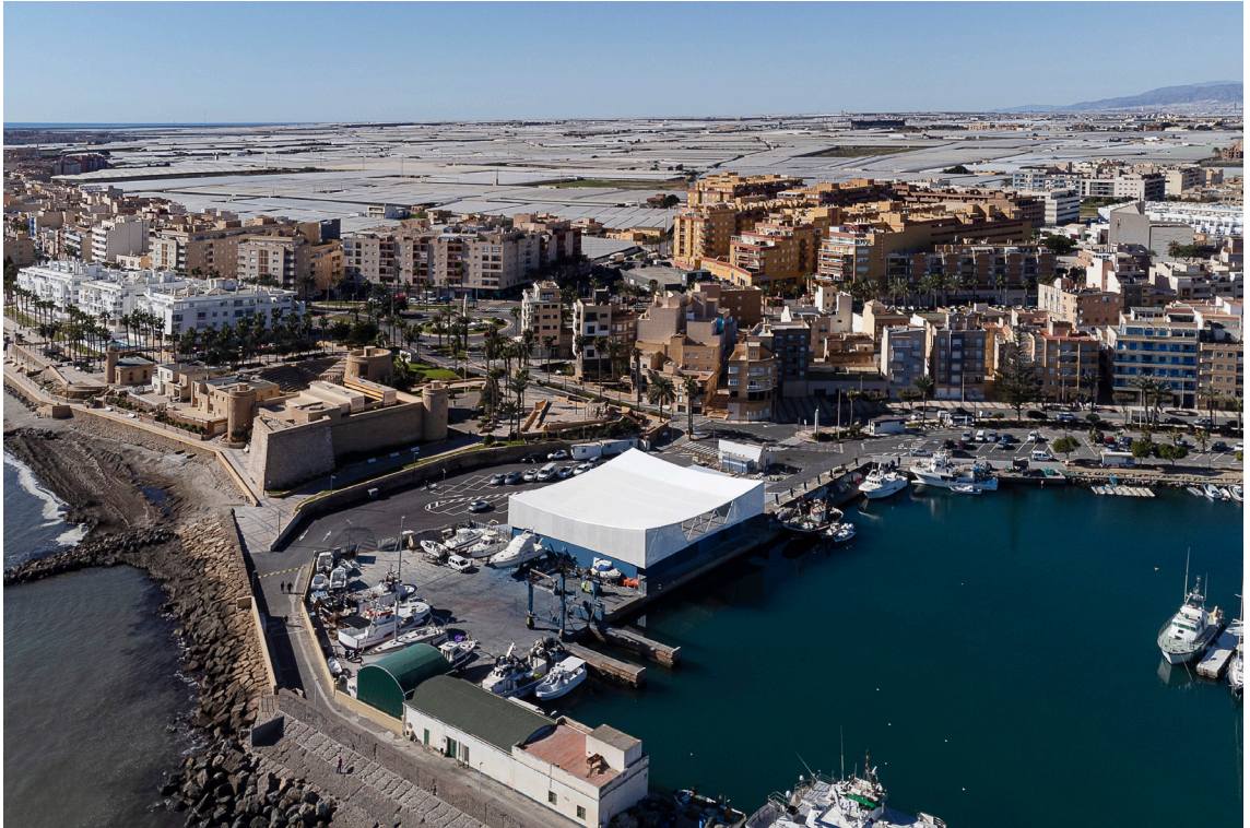
Lonja de pescado y ordenación zona sur del puerto de Roquetas de Mar by Estudio ACTA

The BigMat Group, Building Material Distributors, was created more than 40 years ago, is the first international chain of independent traders for construction materials. The group is present in different countries in Europe: Belgium, Czech Republic, France, Italy, Portugal, Slovakia and Spain.