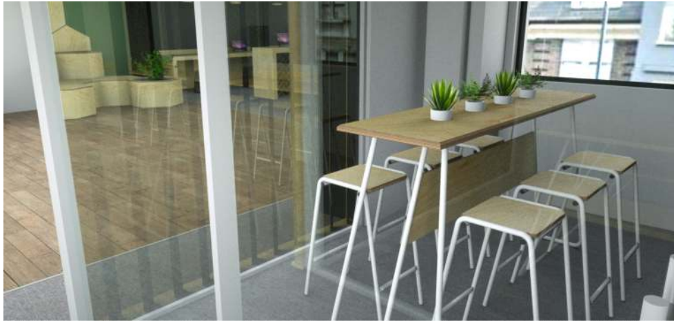
Meeting room 1