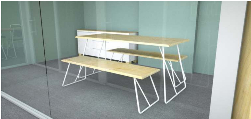
Meeting room 2