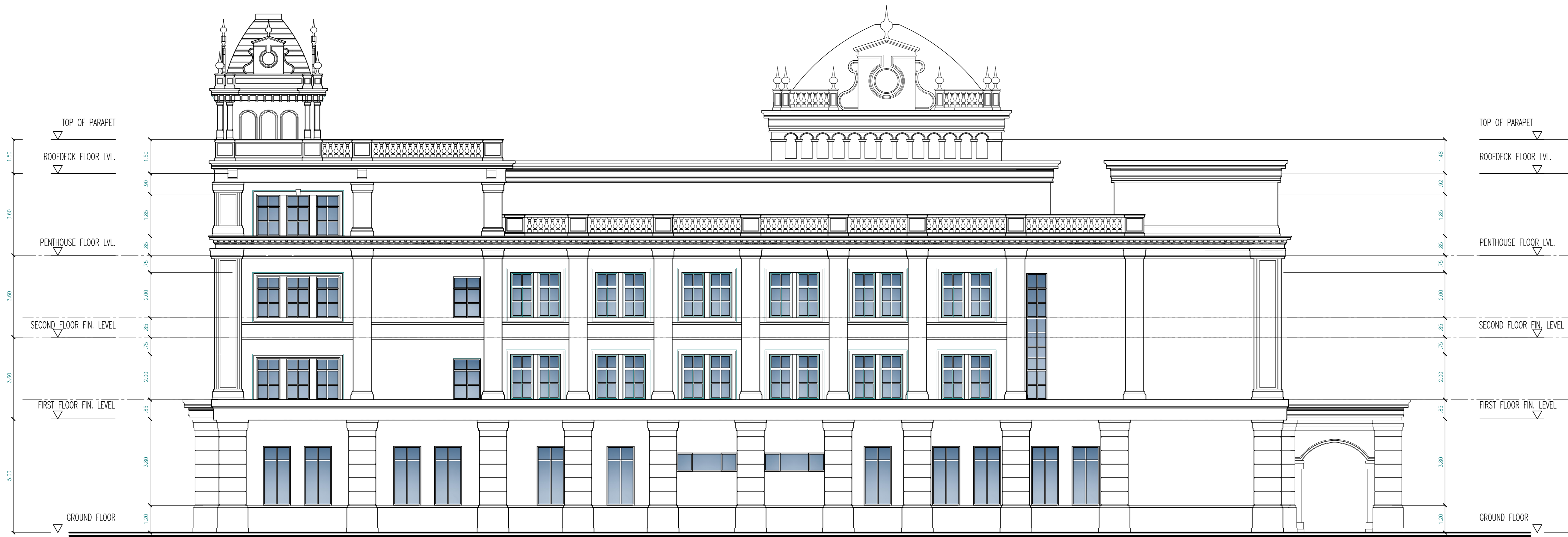
1 A/3 SCALE 1:100 M. RIGHT SIDE ELEVATION BUILDING -B