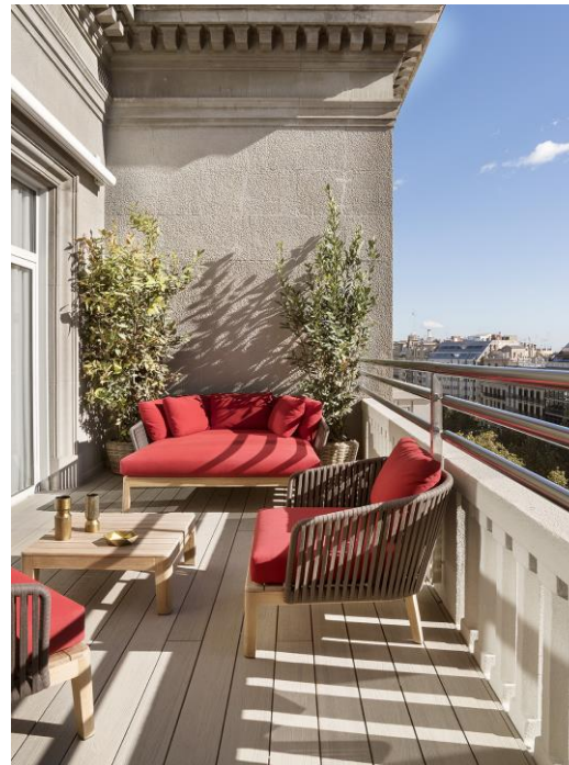
Terrace of the Suite

The presence of books and the range of warm colours in each room, ensure the guests find a cozy environment. Also in the bathrooms, Beriestain has wanted to recreate a warm and cozy environment thanks to the use of warm tones of marble and a brass faucet. The rooms have a touch of exclusiveness thanks to the wallpaper, works of art, and produce a sense of exclusiveness for this project. No less important is the careful lighting with a touch of wall lamps that create an intimate environment for each stay.