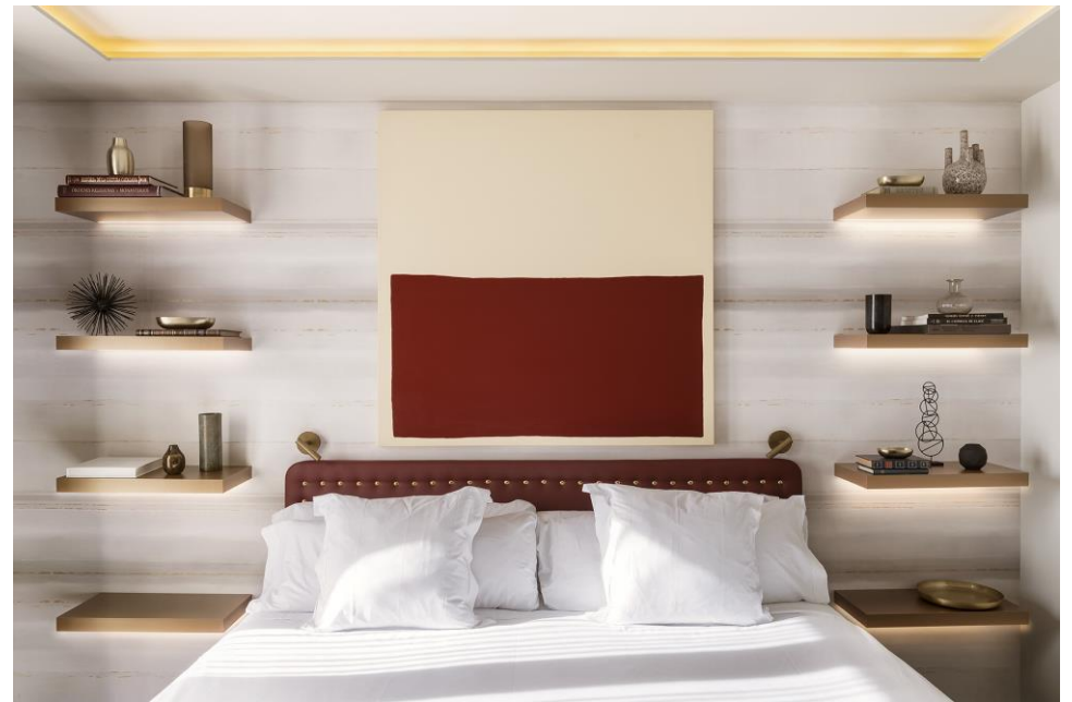
Hotel Vincci Mae, Barcelona

In full view of Diagonal Avenue of Barcelona, the Hotel Vincce Mae has 85 rooms, three of which are suites. This establishment offers its clients a service of a bar and restaurant, both with direct access to two terraces where they can look at an unbearable view of the city. The terrace of the bar boasts a plunge pool, area with hammocks, and a zone to enjoy tapas and cocktails. The restaurant opens up to a terrace to enjoy food and dinners in the open air.