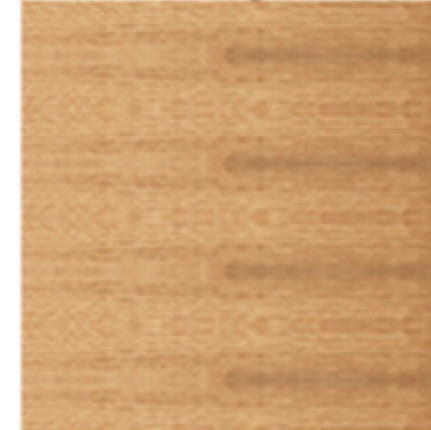
Shown Over Rift White Oak Veneer Assembly: Bookmatch.