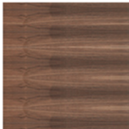
Shown Over Qtr. Walnut Veneer Assembly: Bookmatch.