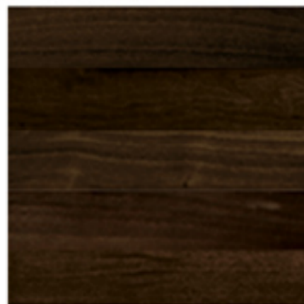
Shown Over Qtr. Walnut Veneer Assembly: Balanced Random Match.