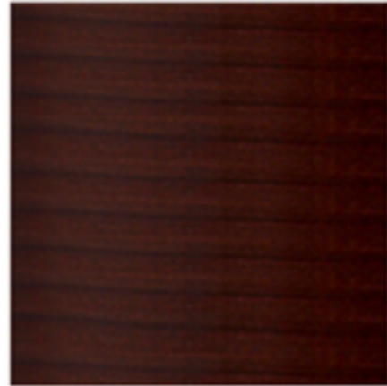
Shown Over Qtr. Walnut Veneer Assembly: Slipmatch.