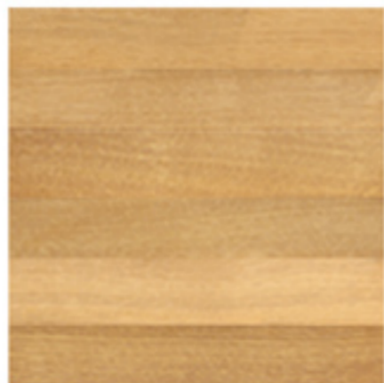
Shown Over Rift White Oak Veneer Assembly: Balanced Random Match.