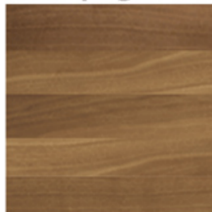
Shown Over Qtr. Walnut Veneer Assembly: Balanced Random Match.