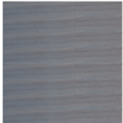
Shown Over Qtr. Walnut Veneer Assembly: Slipmatch.