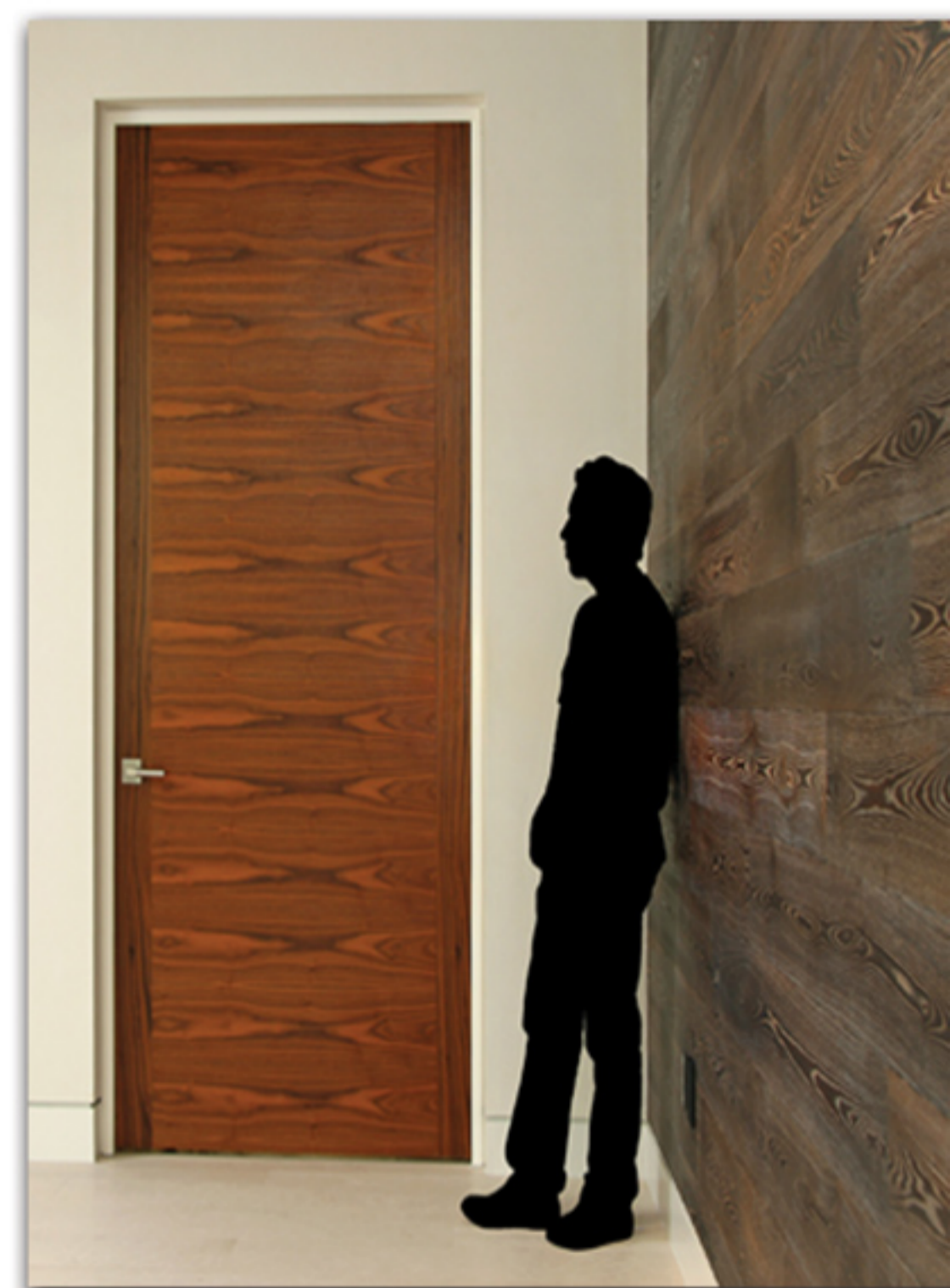
LANCKO Rabbet 1-1/2" Jamb with reveal