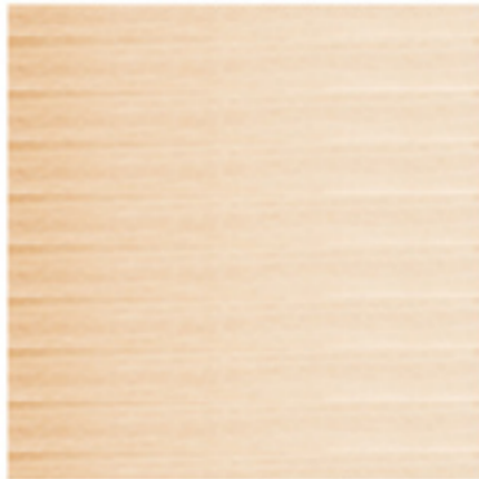
Shown Over Rift White Oak Veneer Assembly: Slipmatch.