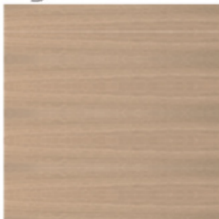
Shown Over Rift White Oak Veneer Assembly: Bookmatch.