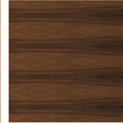
Shown Over Qtr. Walnut Veneer Assembly: Bookmatch.