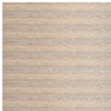
Shown Over Rift White Oak Veneer Assembly: Slipmatch.