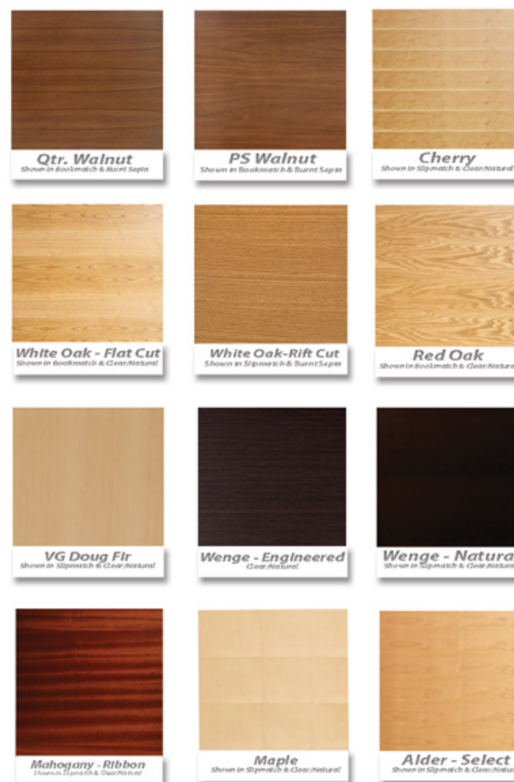
Qtr. Walnut Shown in Bookmatch & Burnt Sepia