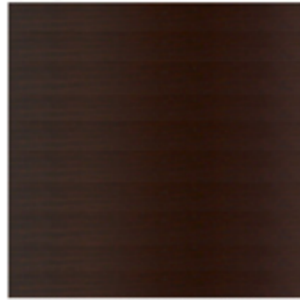
Shown Over Rift White Oak Veneer Assembly: Slipmatch.