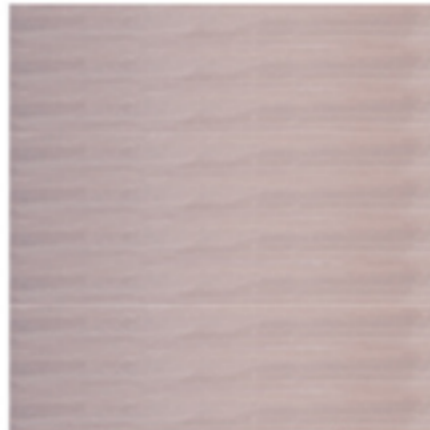
Shown Over Qtr. Walnut Veneer Assembly: Slipmatch.