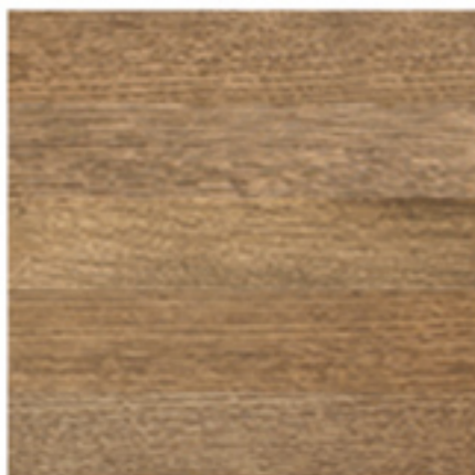
Shown Over Rift White Oak Veneer Assembly: Balanced Random Match.