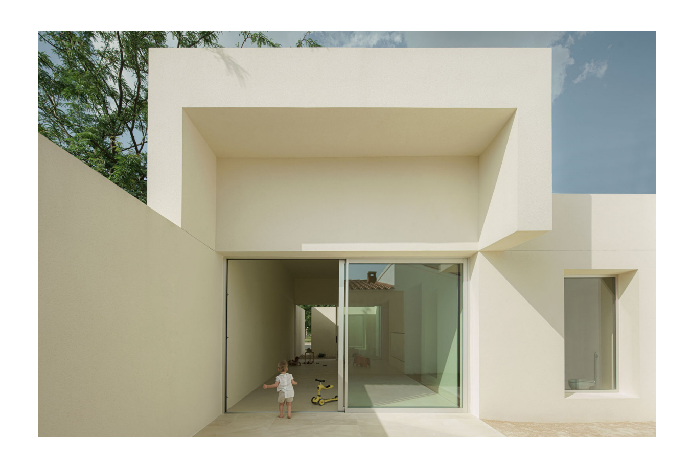
NURSERY SCHOOL. 2023