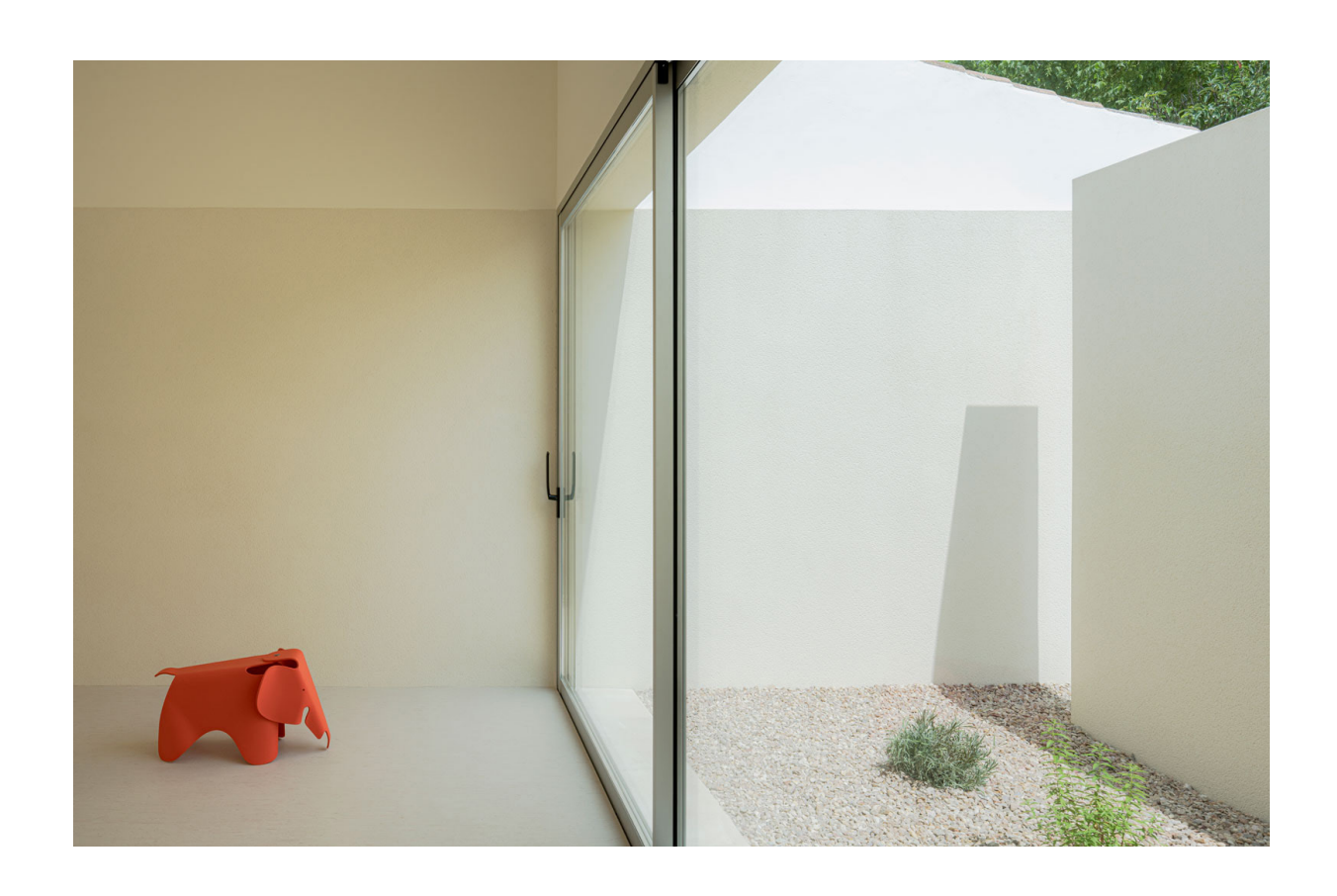
NURSERY SCHOOL. 2023