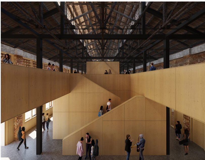
Academy of Music