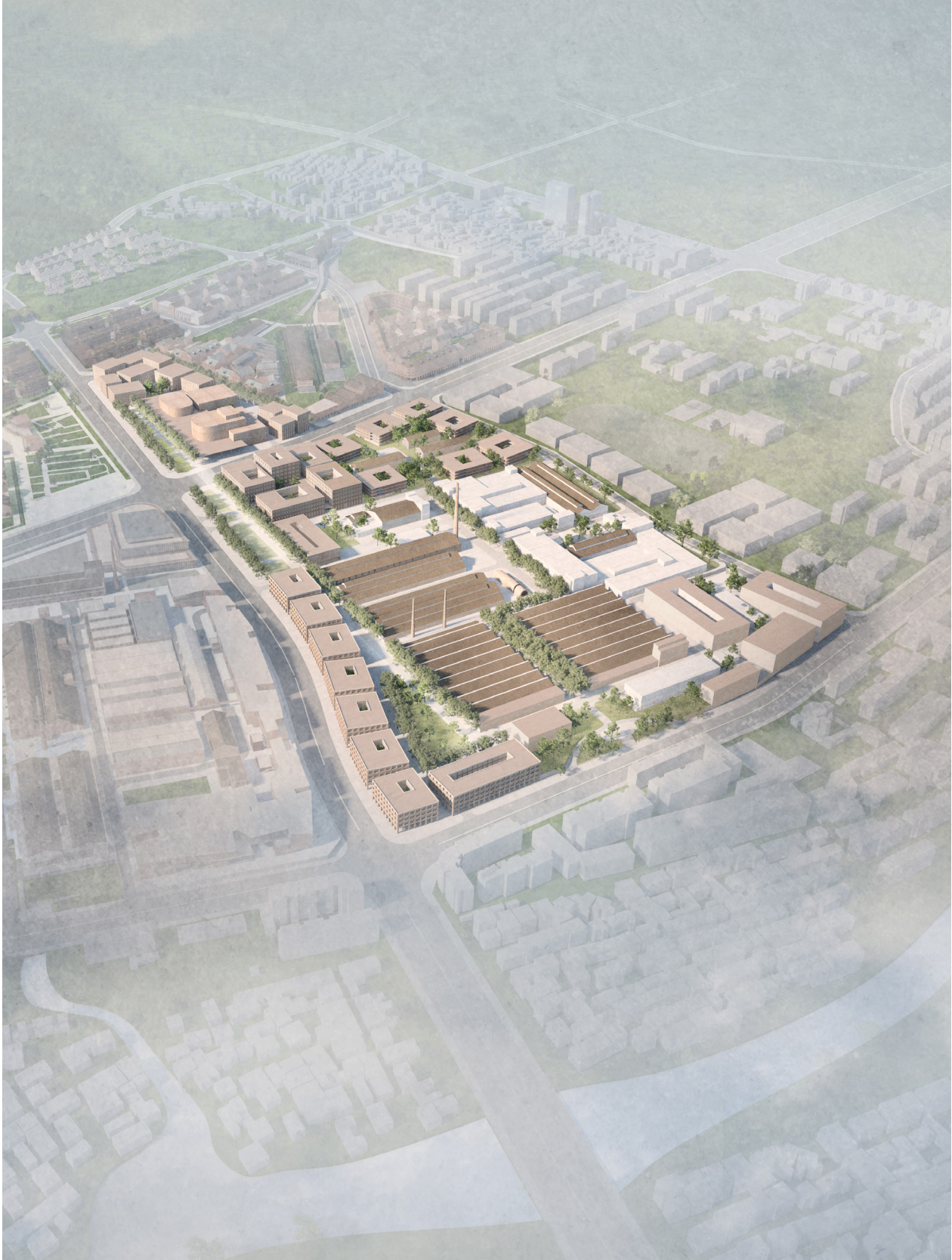
Ceramic Art Avenue Taoxichuan Masterplan