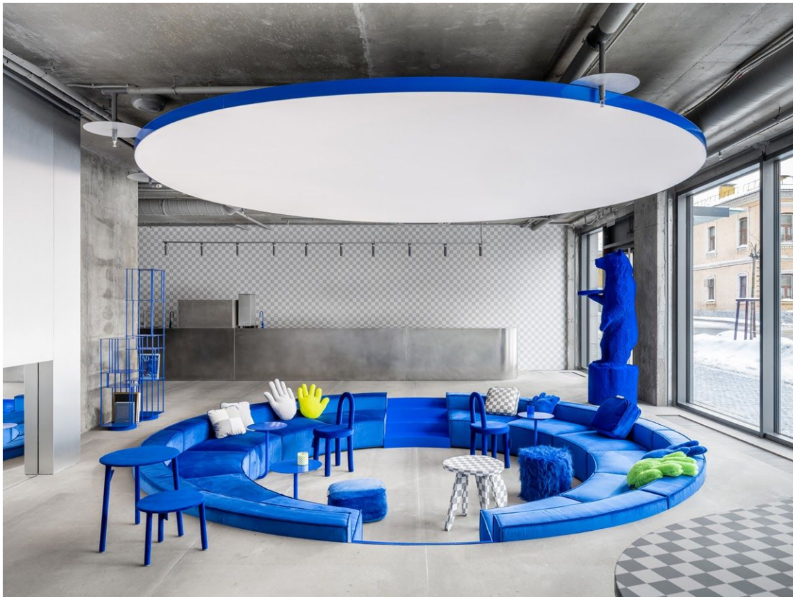
Above: Crosby Studios Store, Moscow.

Following the launch of the lifestyle brand's debut collection and virtual showroom, the mixed-use concept store combines elements of a living room, café, boutique, social gathering space, and design studio.