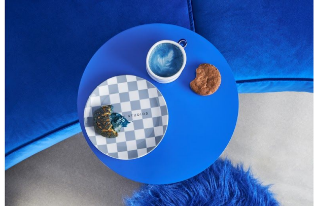
Above: Food and beverage from Crosby Studios Café.

“Crosby Studios Store is an integrated design experience and total work of art, craft, cuisine, architecture and design, dressed from head-to-toe in iconic Crosby Studios designs. The concept store is a place for people to find inspiration, recharge, drink coffee, go on a date, or shop for a new candle or chair. Everything in the space is for sale—from cookies to high-end, hand-crafted furniture pieces,” says Nuriev . “Since this is also our new headquarters, we hope to attract aspiring architects and designers so that they can use Crosby Studios as a resource and wellspring of ideas. Visitors can even watch the Crosby Studios design team in action as they sit beyond a glass wall—almost as if you’re at an open-kitchen restaurant watching the chef prepare your food.”