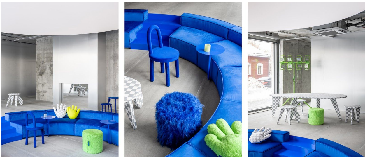
Above: Crosby Studios Store, Moscow.

“As traditional retail continues to pivot toward the unconventional and experiential, Crosby Studios Home offers a mixed reality model, allowing customers to shop within a virtual environment or in-person at Crosby Studios Store,” explains Nuriev . “We created this space to be accessible for everyone, so that anyone who walks through our doors can find their own world within ours, or perhaps imagine a new one.”