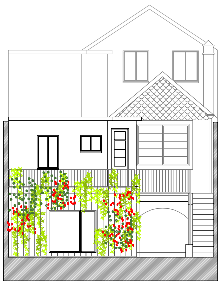
ALÇADO PARA O PÁTIO