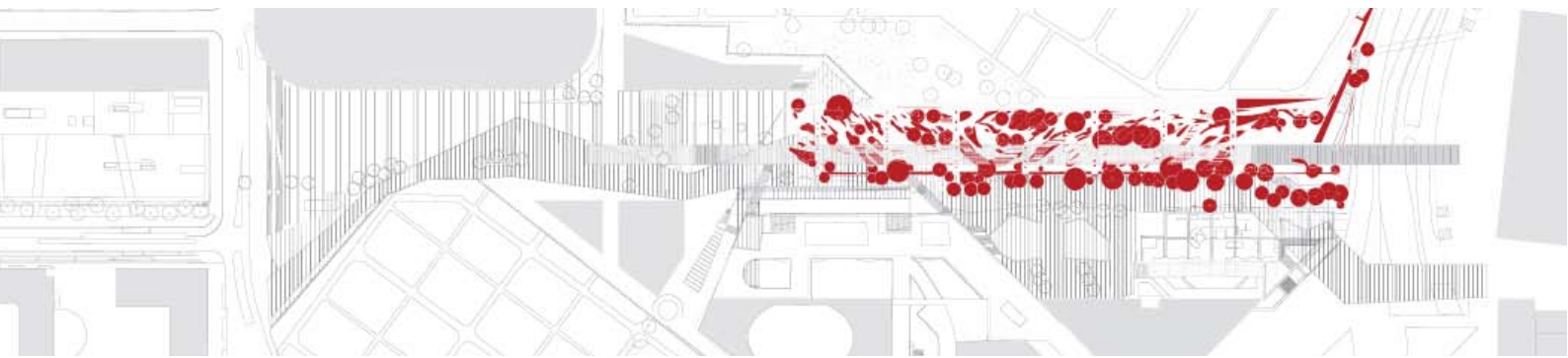
THE GILLES CLEMENT'S GARDEN