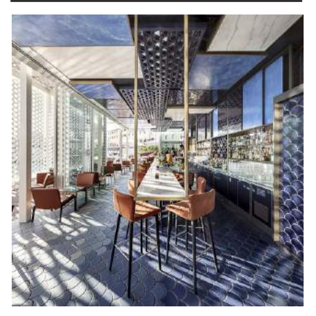
Address: Moll d'Escar 1, Barcelona Client: Marina Port Vell, Salamanca Group Floor Area: 198m<sup>2</sup> Completed: January 2015