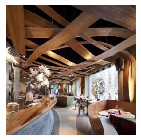
Address: Av. Paralelo 148, Barcelona Client: Ikibana The Sao Paolo Way, S.L. Floor Area: 250m<sup>2</sup> Completed: June 2012