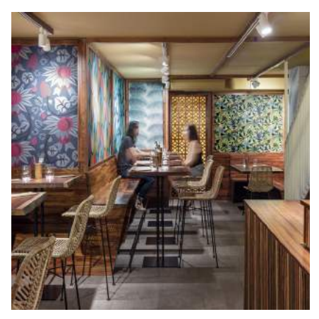
Address: Carrer de Còrsega 231, Barcelona Client: Joâo Alcântara, Dani Alves Floor Area: 176m<sup>2</sup> Completed: April 2016