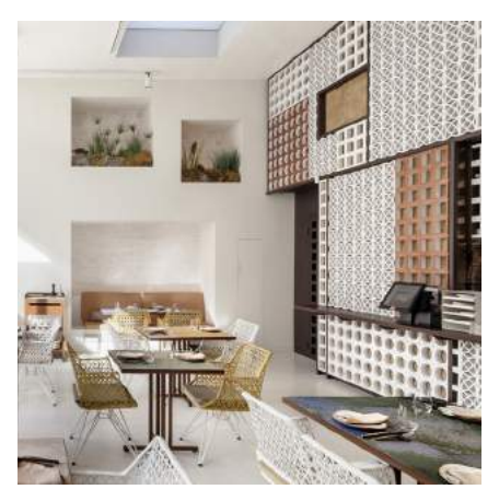
Address: Calle Villarroel 163 , Barcelona Client: E. Xatruch, O.Castro y M. Casañas Floor Area: 520m<sup>2</sup> Completed: December 2014