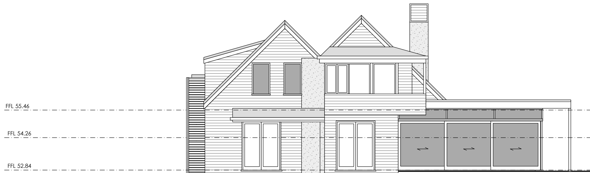
north east elevation