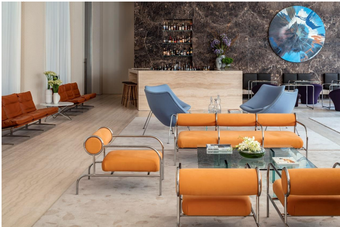
Lobby & Sheshbesh Lounge at The Jaffa

Golda's Deli is a traditional New York style delicatessen, serving classics like bagels and lox, tuna melts, and double decker sandwiches. Guests are served from an open kitchen counter for a truly authentic deli experience. Golda's Deli also services the Pool Bar.