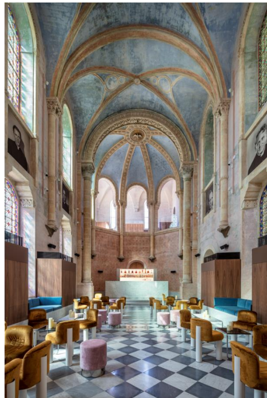
Stairwell (Left), and Chapel (Right) at The Jaffa