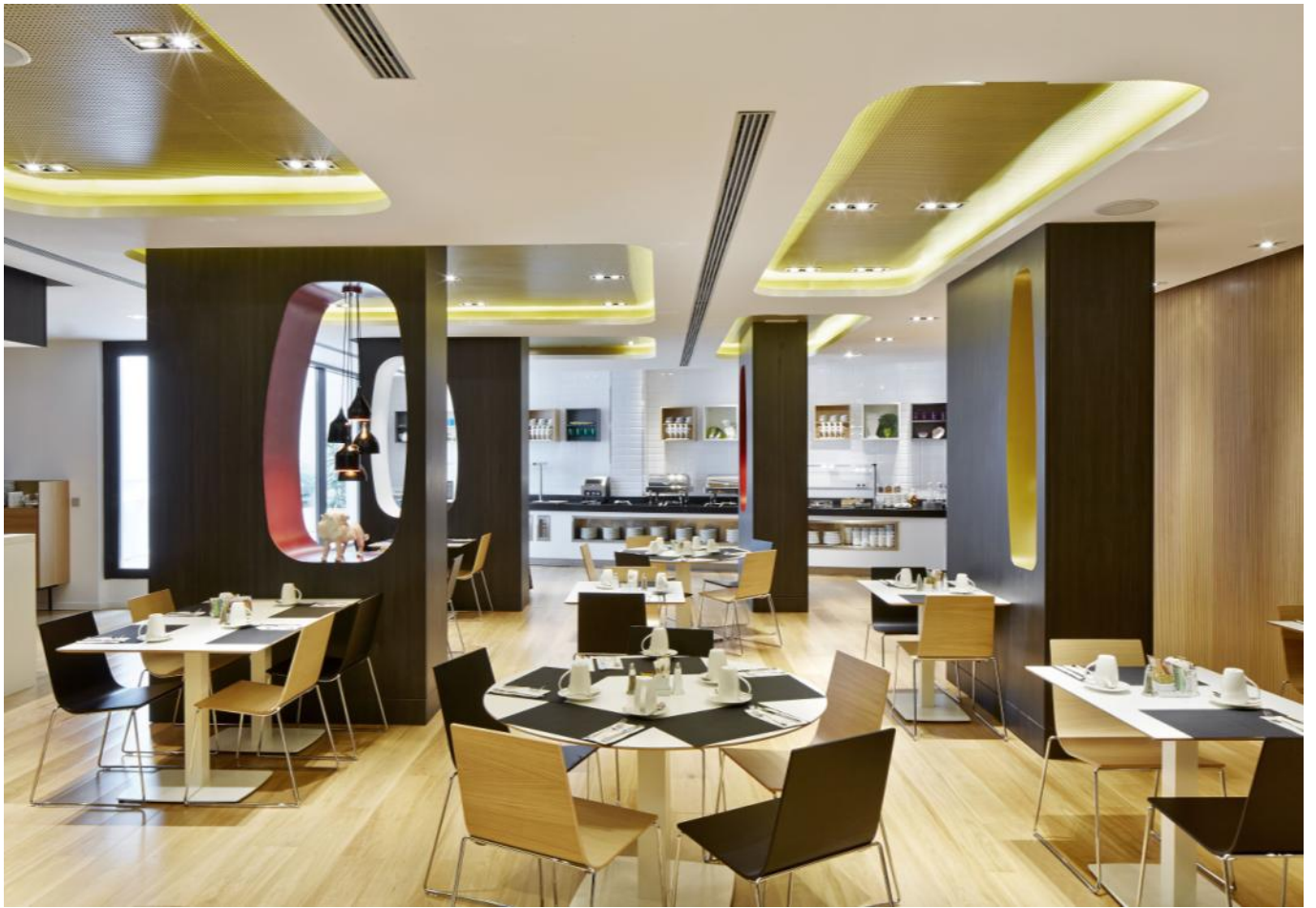
The restaurant with the breakfast buffet and two meeting rooms is located in the basement. A flexible system of mobile partition panels enable the space to be divided as necessary, adapting it to the required use.