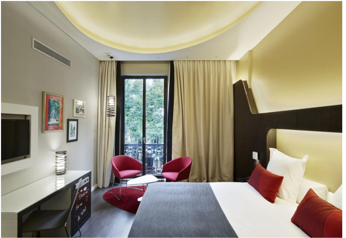
Gold and gray tones in combination with indirect linear lighting give the rooms a warm and elegant atmosphere.