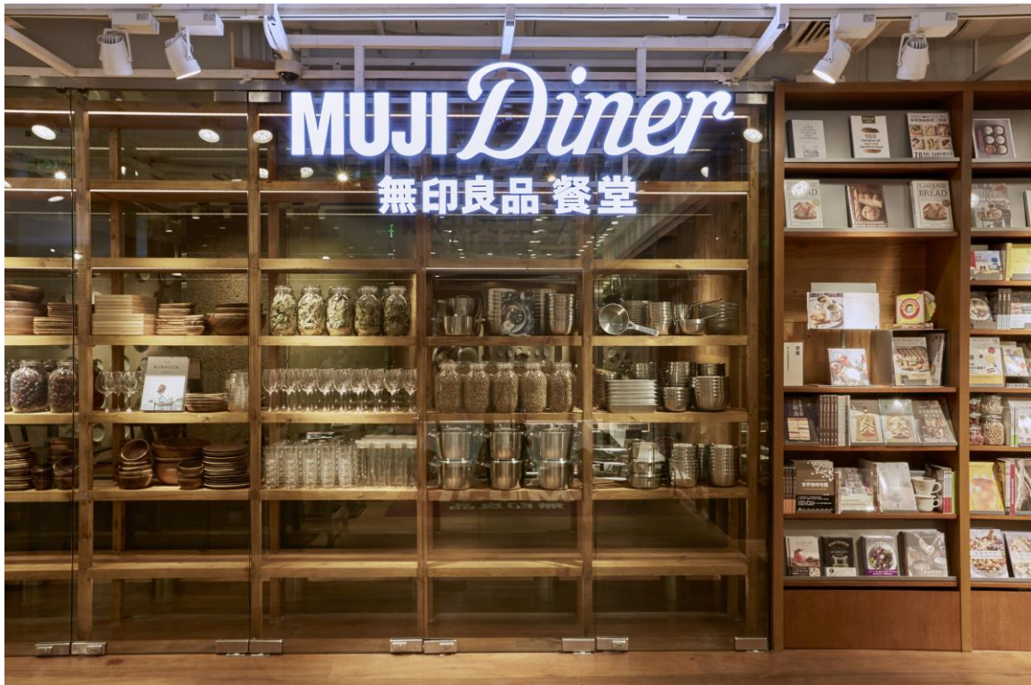
Entrance to MUJI Diner, part of MUJI Hotel Shenzhen