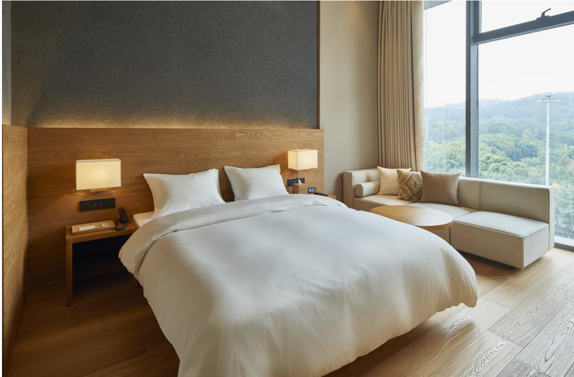
Inside a large double room at MUJI Hotel Shenzhen

Shenzhen is located in Guangdong Province. The hotel is located close to the heart of the city in the new UpperHills multi-use complex. The reception desk is located on the second floor, with floors four through six holding a total of 79 rooms. Pillars and walls of traditional Chinese houses are repurposed in interior walls and courtyards. A brand new MUJI store on the second and third floors will open simultaneously with the hotel, to help customers experience the world view of MUJI.