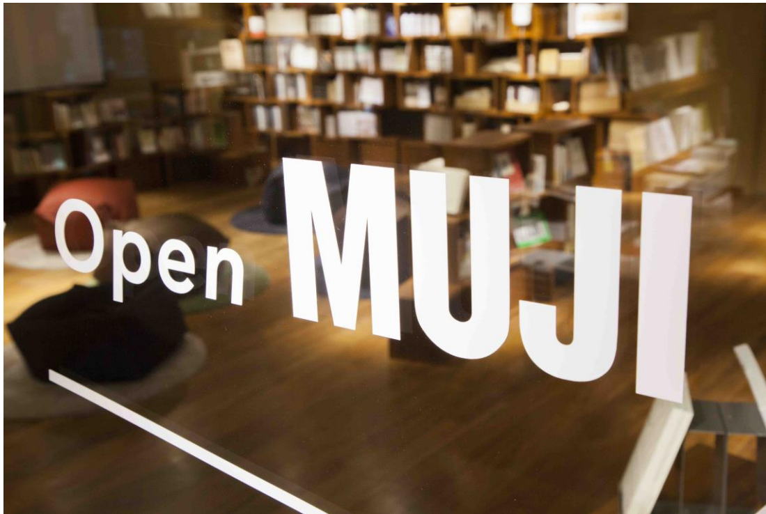
Entrance to Open MUJI, the events and workshop space inside the MUJI Hotel building