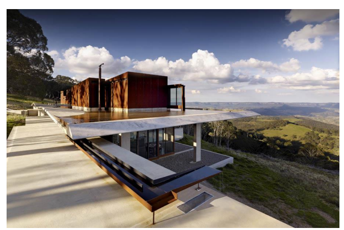
Australian House of the Year 'Invisible House' by Peter Stutchbury Architecture NSW

A sight to behold, the Invisible House by Peter Stutchbury Architecture was named 'Australian House of the Year'.