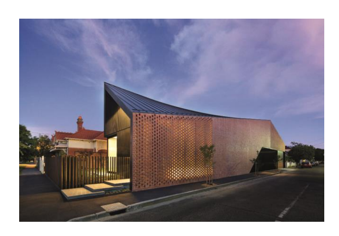
House in a Heritage Context (joint winner) 'Middle Park House' by Jackson Clements Burrows VIC