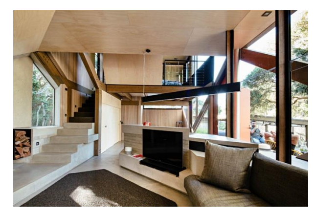
House Alteration & Addition under 200 m<sup>2</sup> 'Cabin 2' by Maddison Architects VIC