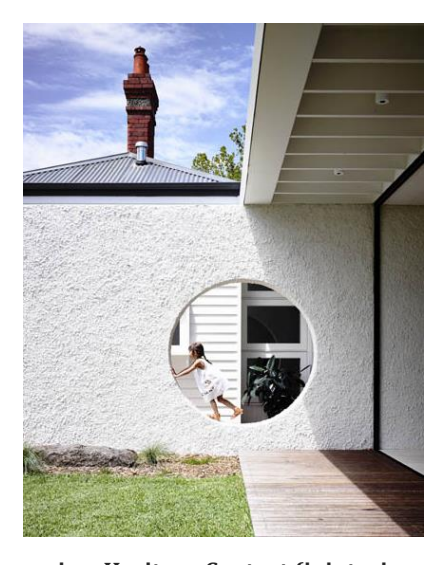
House in a Heritage Context (joint winner) 'Westgarth House' by Kennedy Nolan VIC