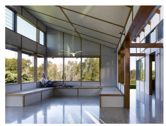
New House under 200 m<sup>2</sup> 'Dogtrot House' by Dunn and Hillam Architects NSW

The award category winners are as follows: