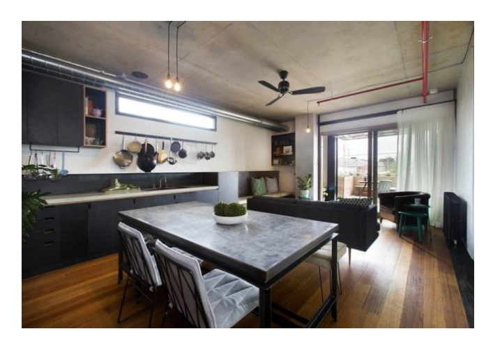
Sustainability 'The Commons' by Breathe Architecture VIC