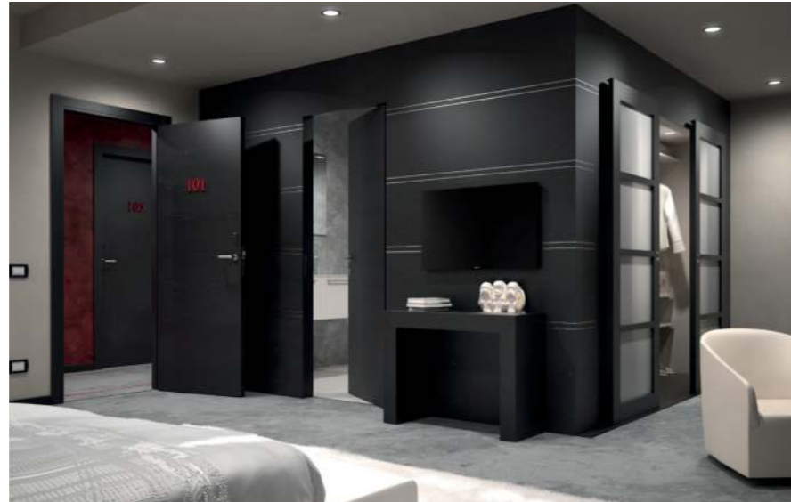
Zeus fire doors system