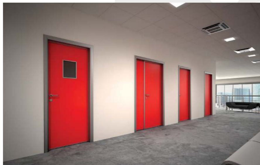
Alutekna technical doors