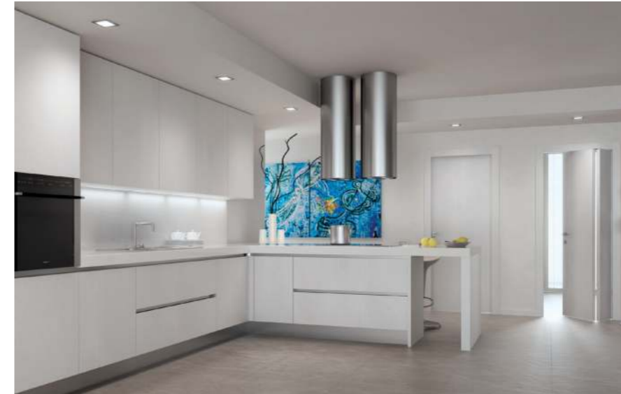
Italian contemporary style