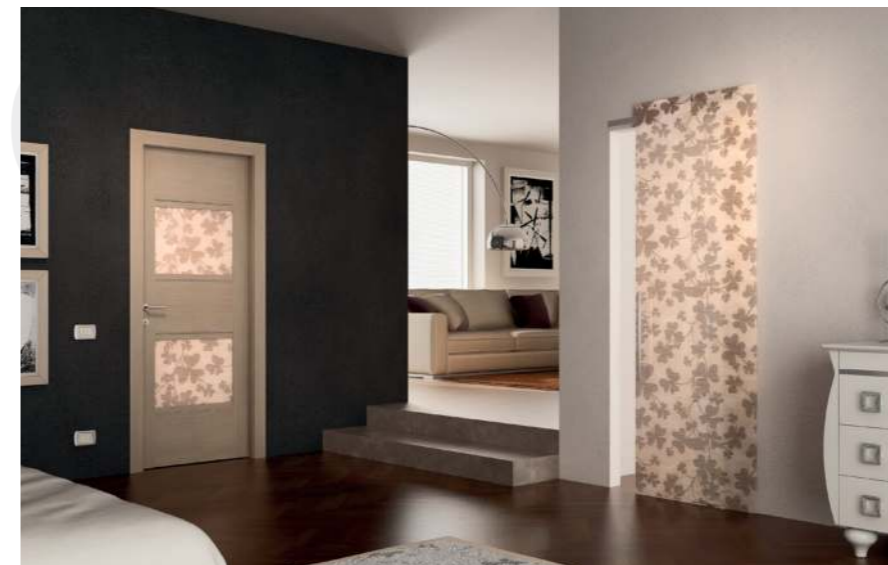
Modern Italian timeless style