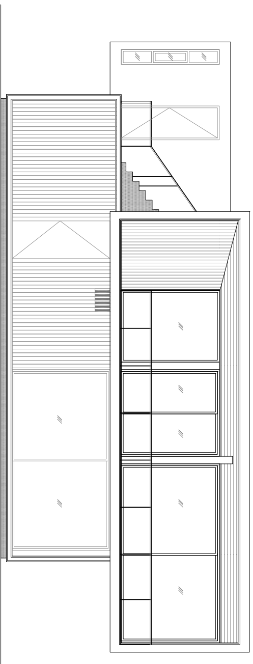
ELEVATION 1 0 1 2 5