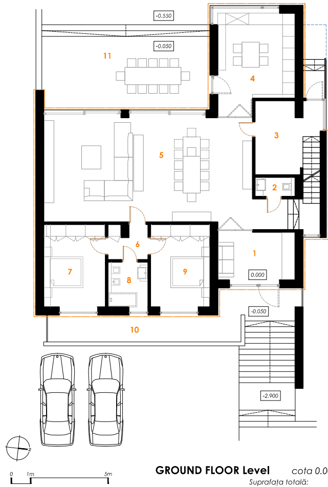
GROUND FLOOR Level cota 0.000, sc 1:100 Suprafata totală: 142.70 m.p. Suprafata total CASA: 345.00 m.p.