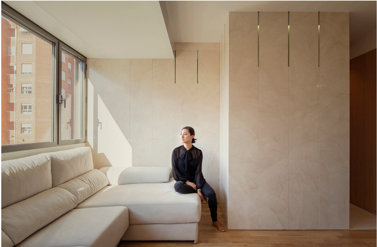
STONE APARTMENT. 2019