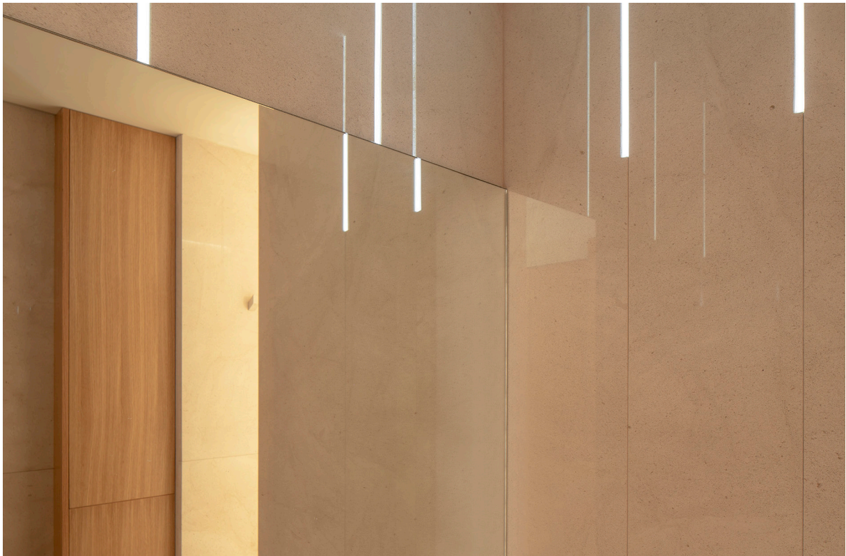
STONE APARTMENT. 2019