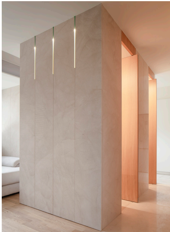
STONE APARTMENT. 2019