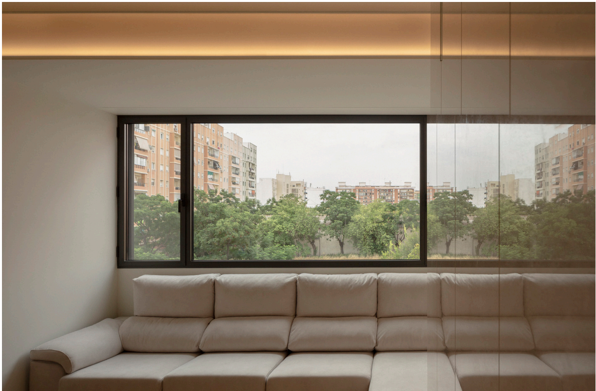
STONE APARTMENT. 2019