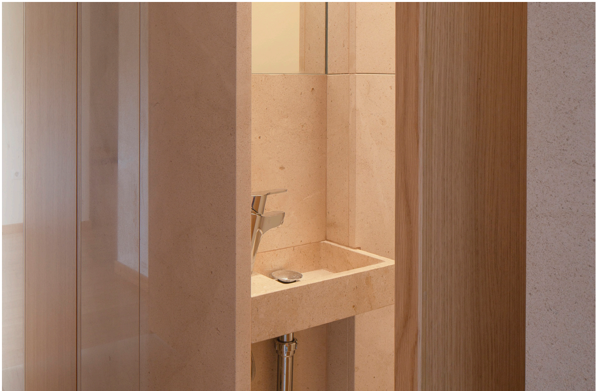
STONE APARTMENT. 2019