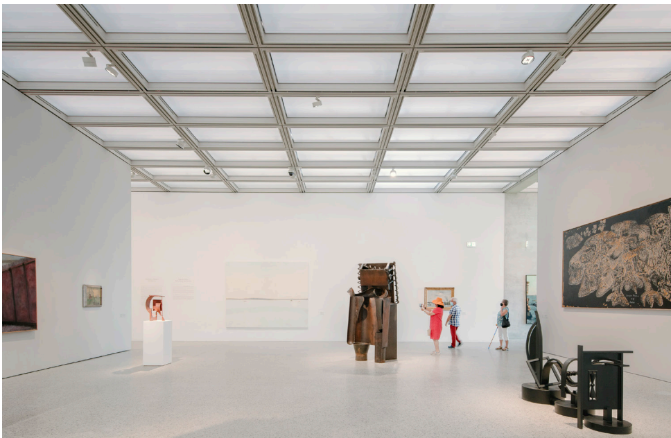
Carmen Würth Forum, Phase 2