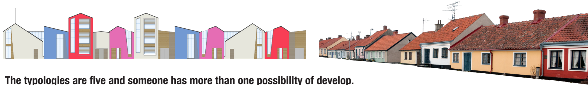
The typologies are five and someone has more than one possibility of develop.